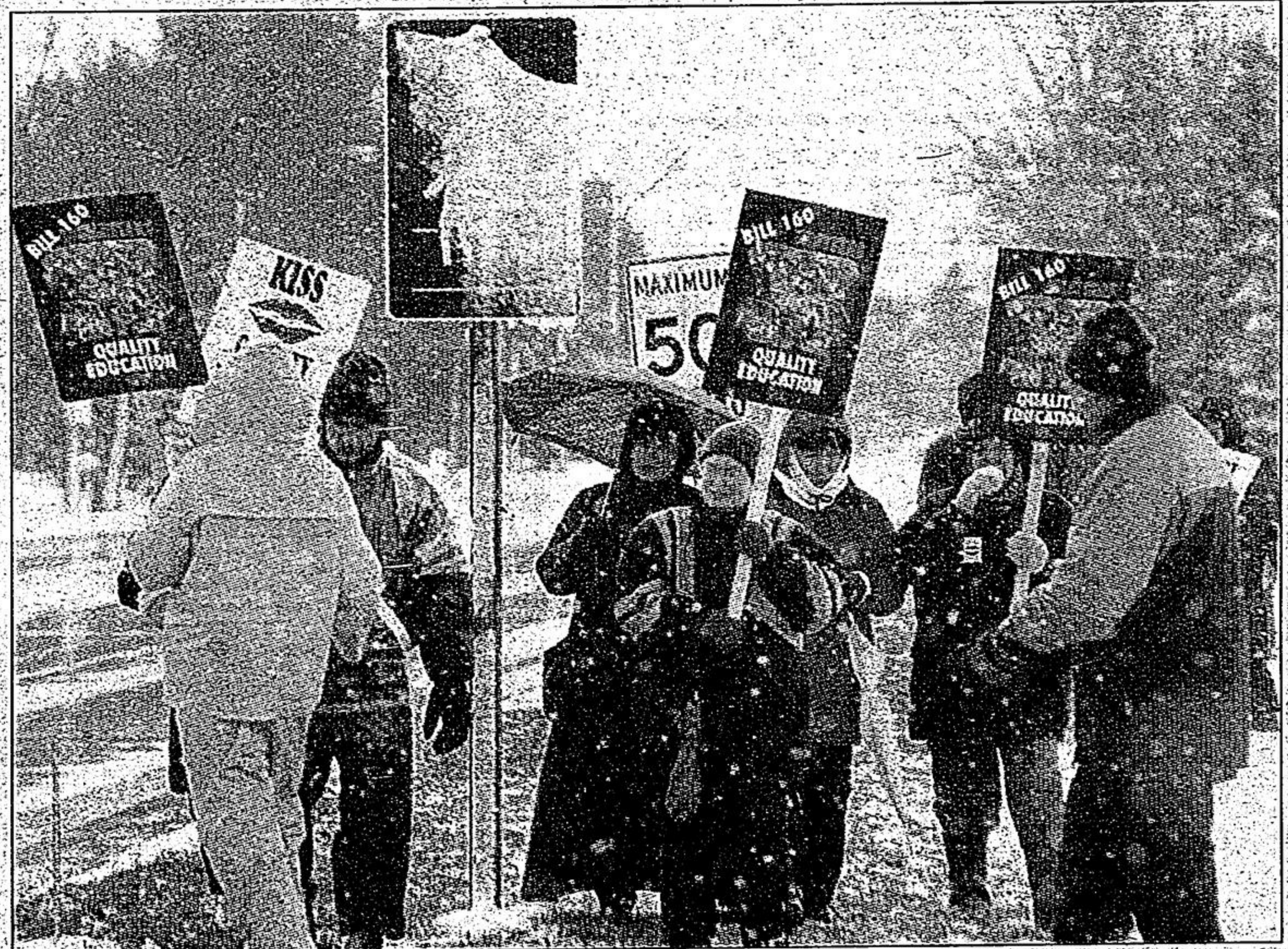
NO SCHOOL CROSSING HERE: Teachers picket just outside Glad Park Public School Monday morning braving the cold temperatures and the season's first snowfall to protest the provincial government's education reform legislation. Here, the snow seems to cooperate, covering the School Crossing sign.