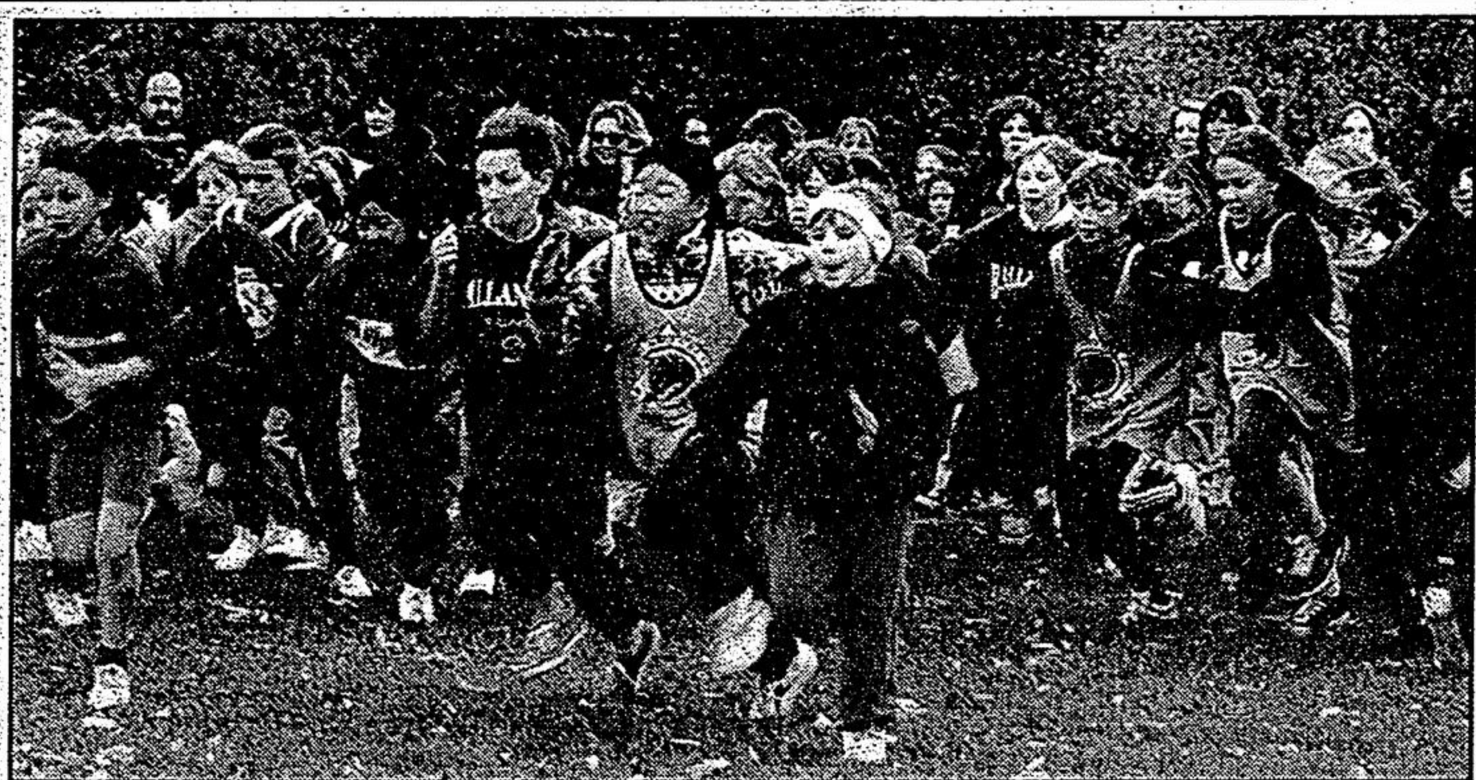
THEY'RE OFF AND RUNNING: Bruce's Mill Conservation Area played host to the annual York Region Elementary Athletic Association area north cross-country meet on Tuesday. Part of the action saw these tyke girls get off to a good start in their age group event.