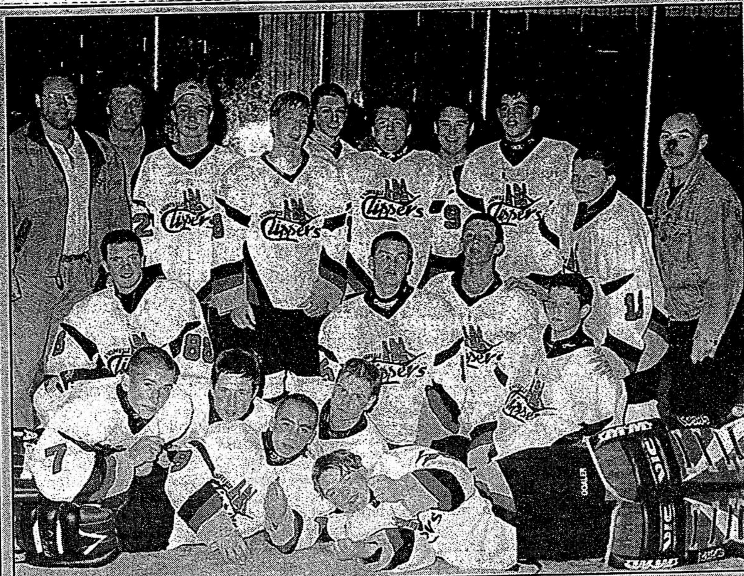
TOURNAMENT CHAMPIONS: The Stouffville Edwards Murphy bantam Clippers had a good reason to pose for a team photograph recently, as they captured the Dundas Hockey Tournament in Dundas, Ont. In addition to taking home top prize in that event the Clippers have been playing some good hockey recently as they've gone undefeated through their first eight games of the young season.

The Spartans are scheduled to play their first home game of the season today at 3:35 p.m.