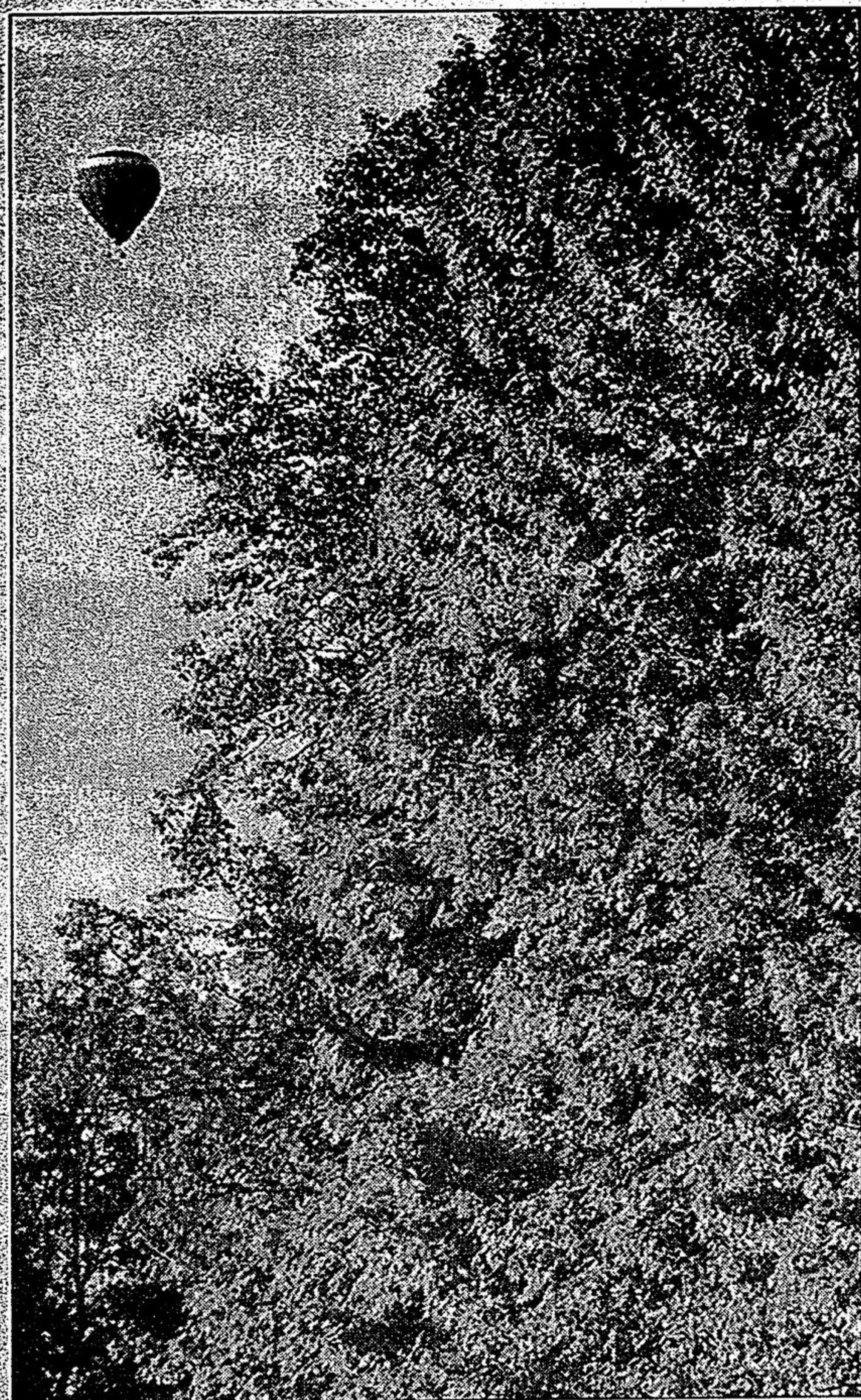
AIRBORNE: A hot air balloon travels on a slight breeze set off against the changing leaves north of Ballantrae on Monday.