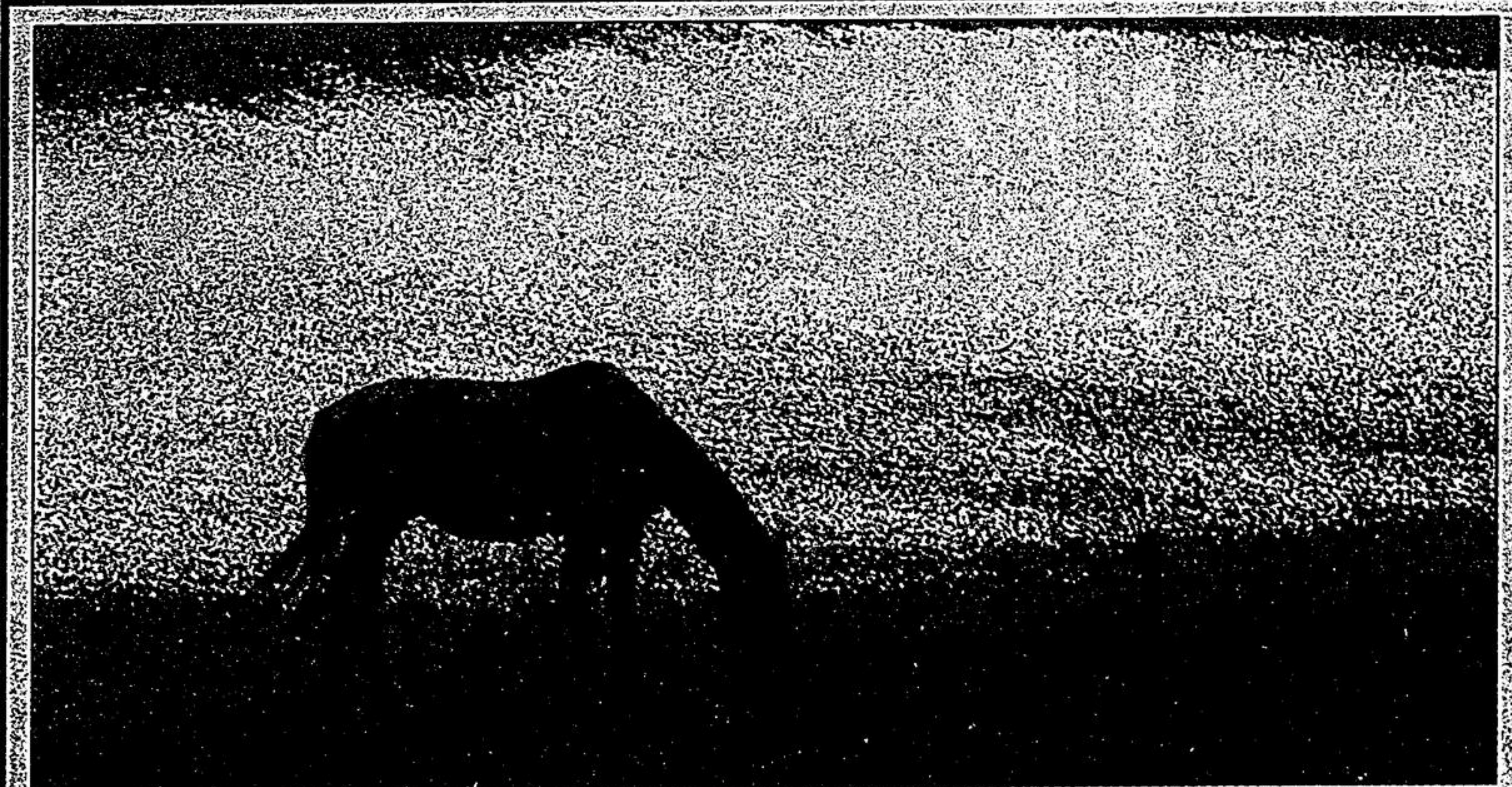
AMAZING GRAZE This peaceful scene was captured at James Sabiston's Longview Farms on Bloomington Road this week.