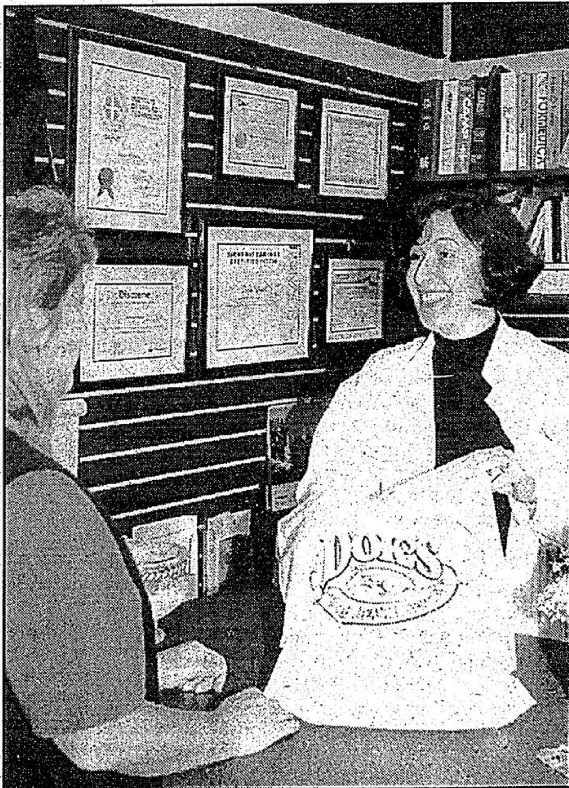
DOK's friendly staff is able to answer any question.

Medical professionals are invited to DOK'S Home Health Centre's grand opening October 9, 1997, from 4 pm to 8 pm. RSVPs are required by October 3.