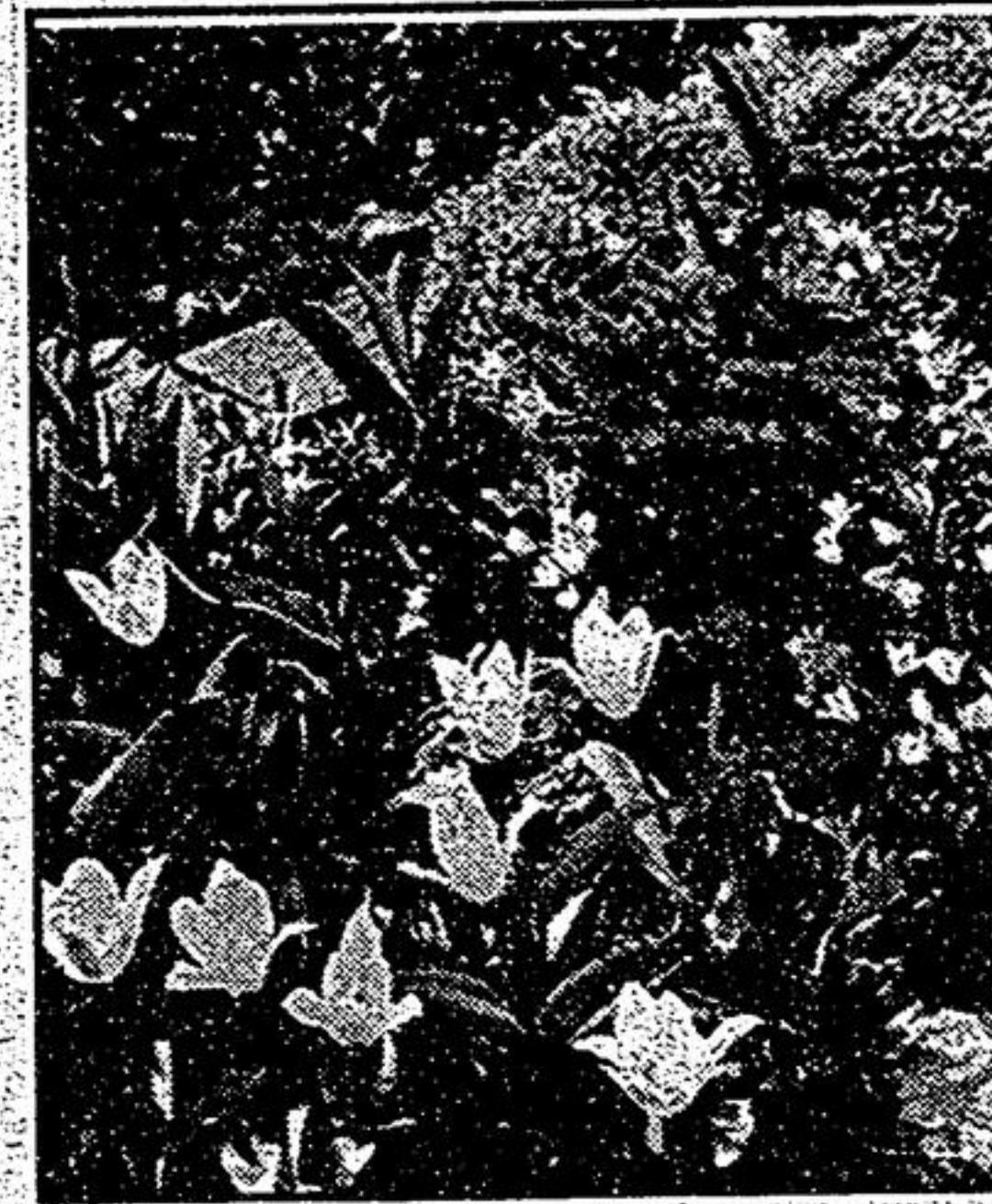
Your spring garden needs to be planted now.

This article was submitted by Netherland Flowerbulb Information Centre.