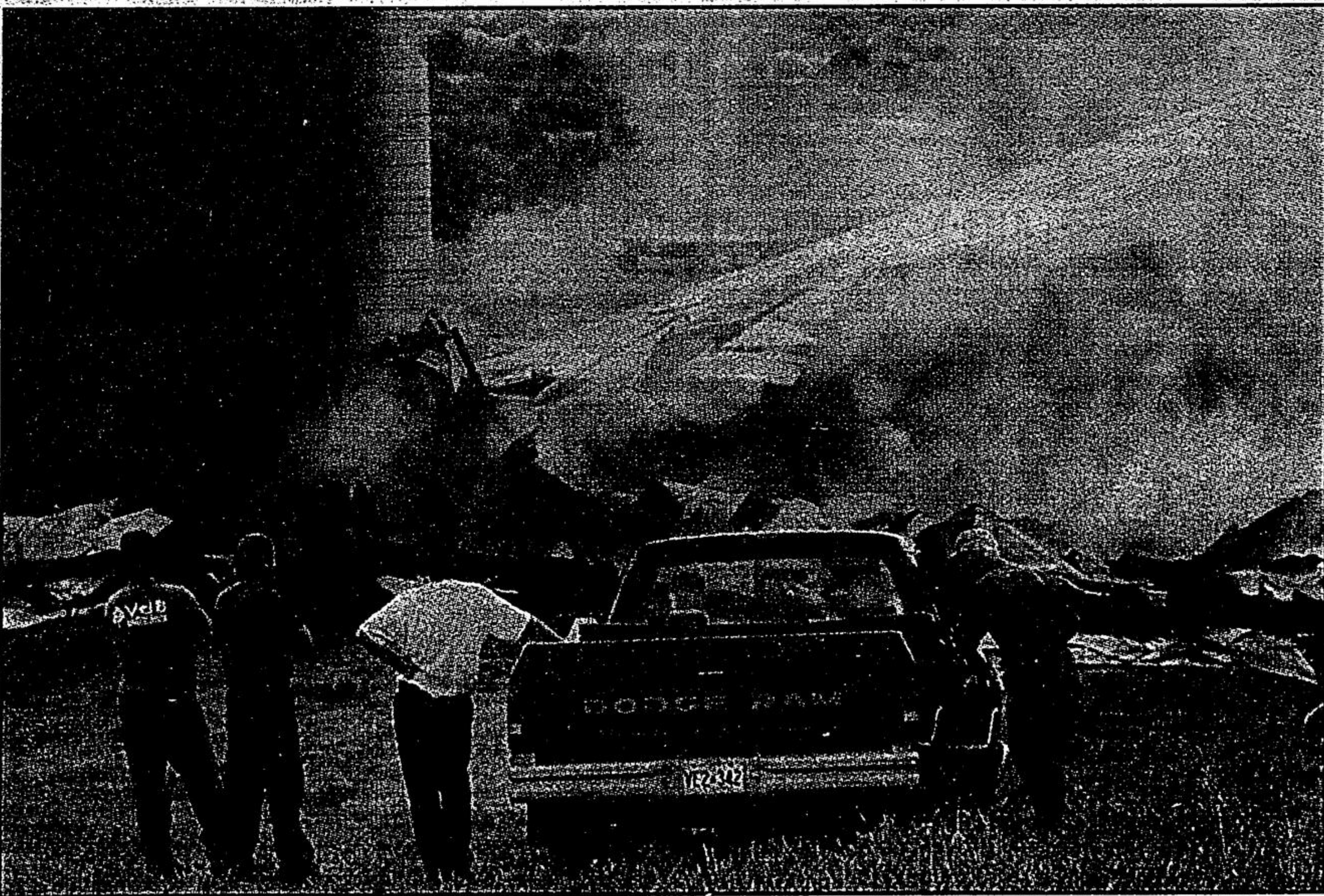
BARN FIRE: A fire at the White farm on Kennedy Road near Bloomington Road engulfed a cattle barn, killing 17 calves and one cow. Pictured here are some of the neighbours and friends who helped move cattle and douse flames with the Whitchurch-Stouffville Fire Department.