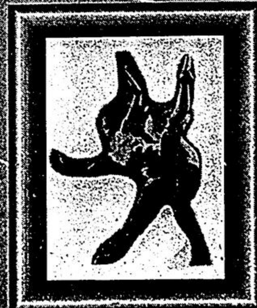
American Repertory Ballet