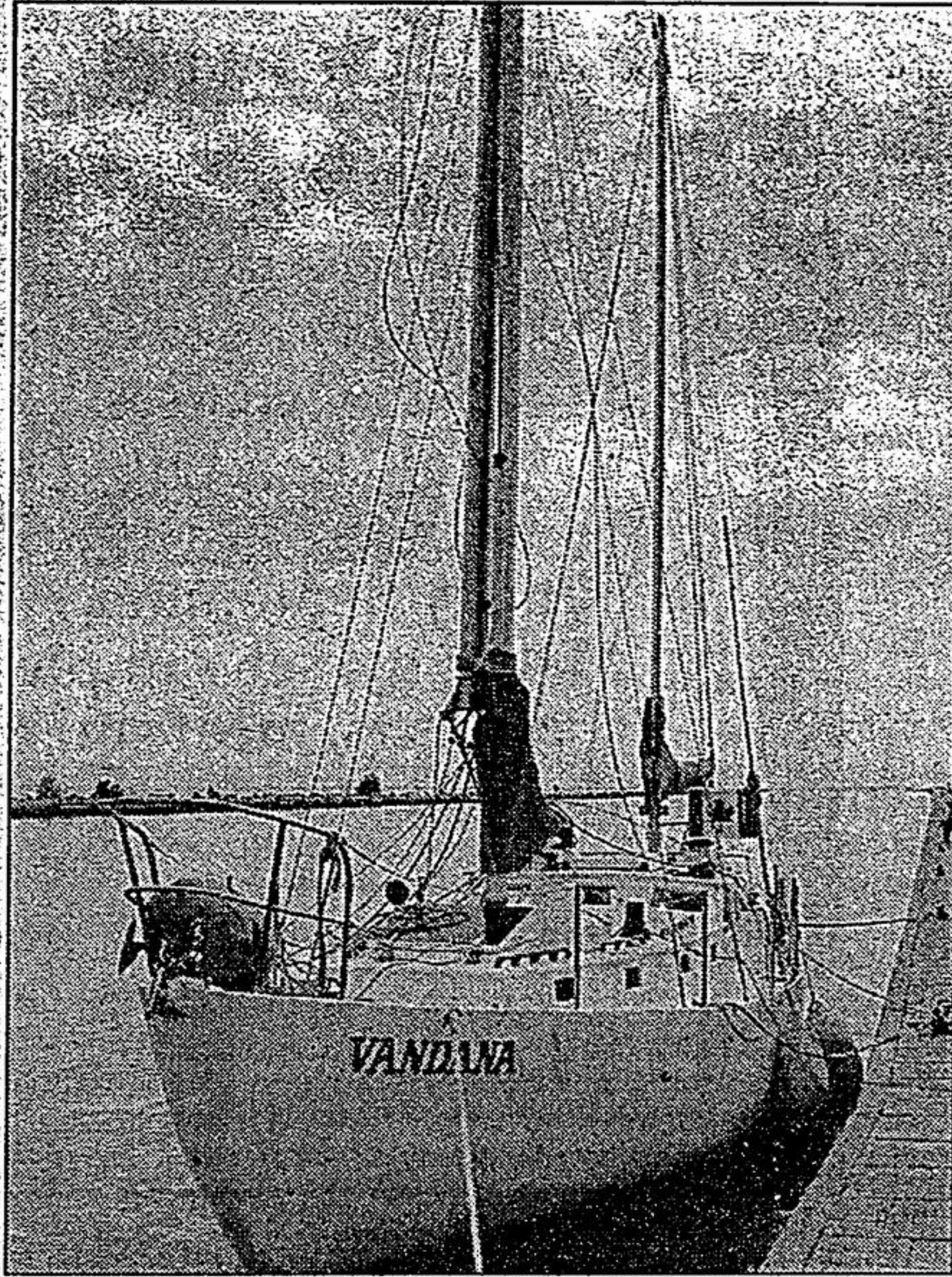
The Vandana was damaged after a run-in with the HMS Bounty. The Franzens were not injured in the collision.

The Bounty sustained some damage, but it isn't known if it will affect its scheduled trip to the East Coast Tuesday.