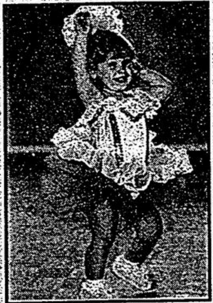
Where Dreams Begin...