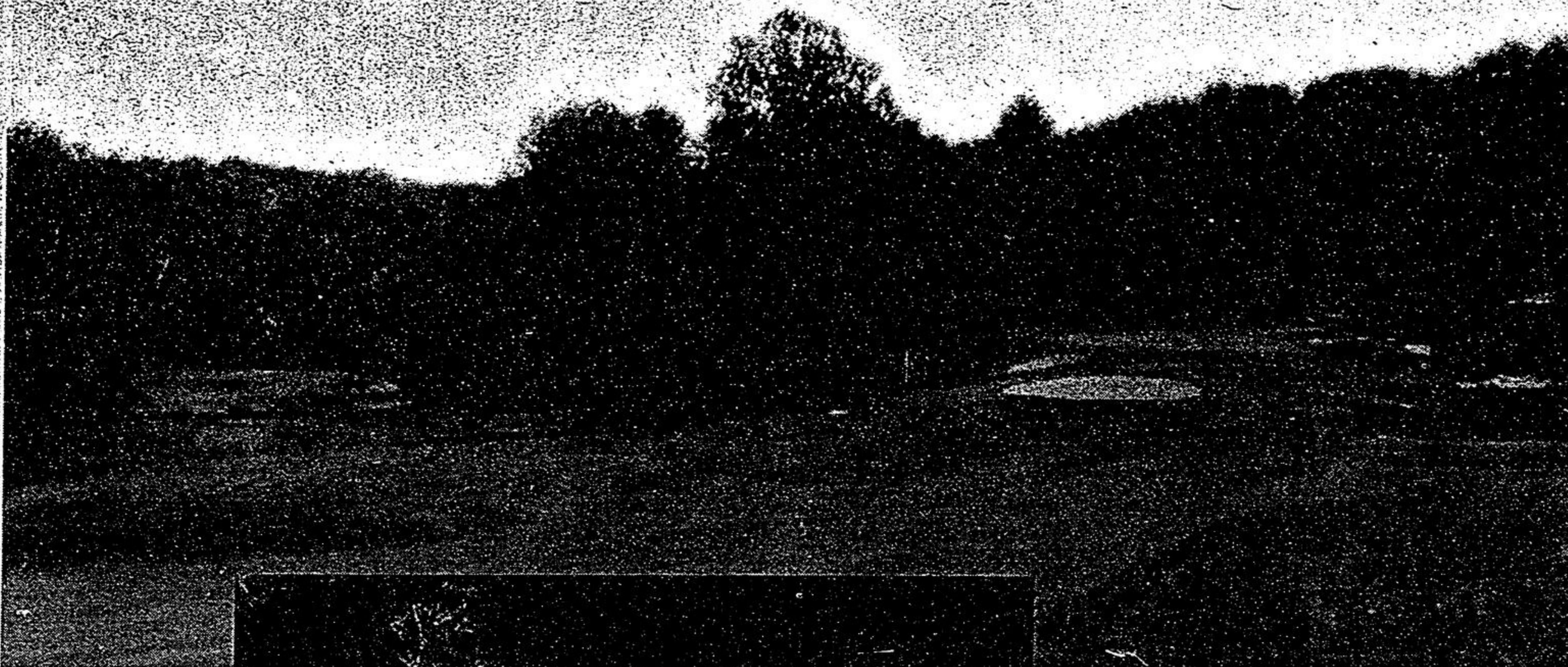
Outstanding golf facilities dot the Region's map