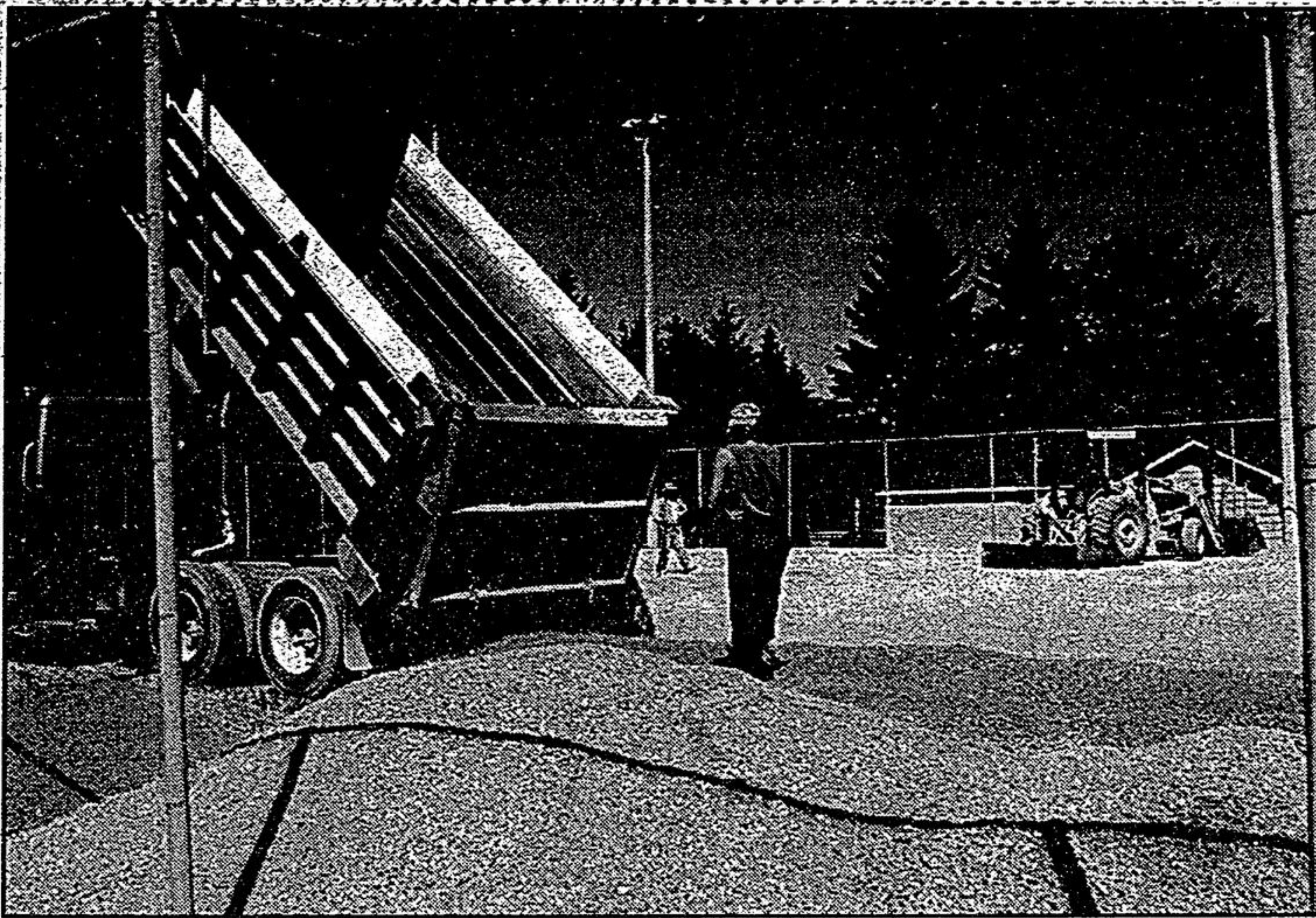
TENNIS ANYONE: The folks at Parks and Recreation have been busy. Not only does Memorial Park have new equipment (see previous page), work has just begun on the new tennis courts at Vandorf, much to the delight of local enthusiasts.