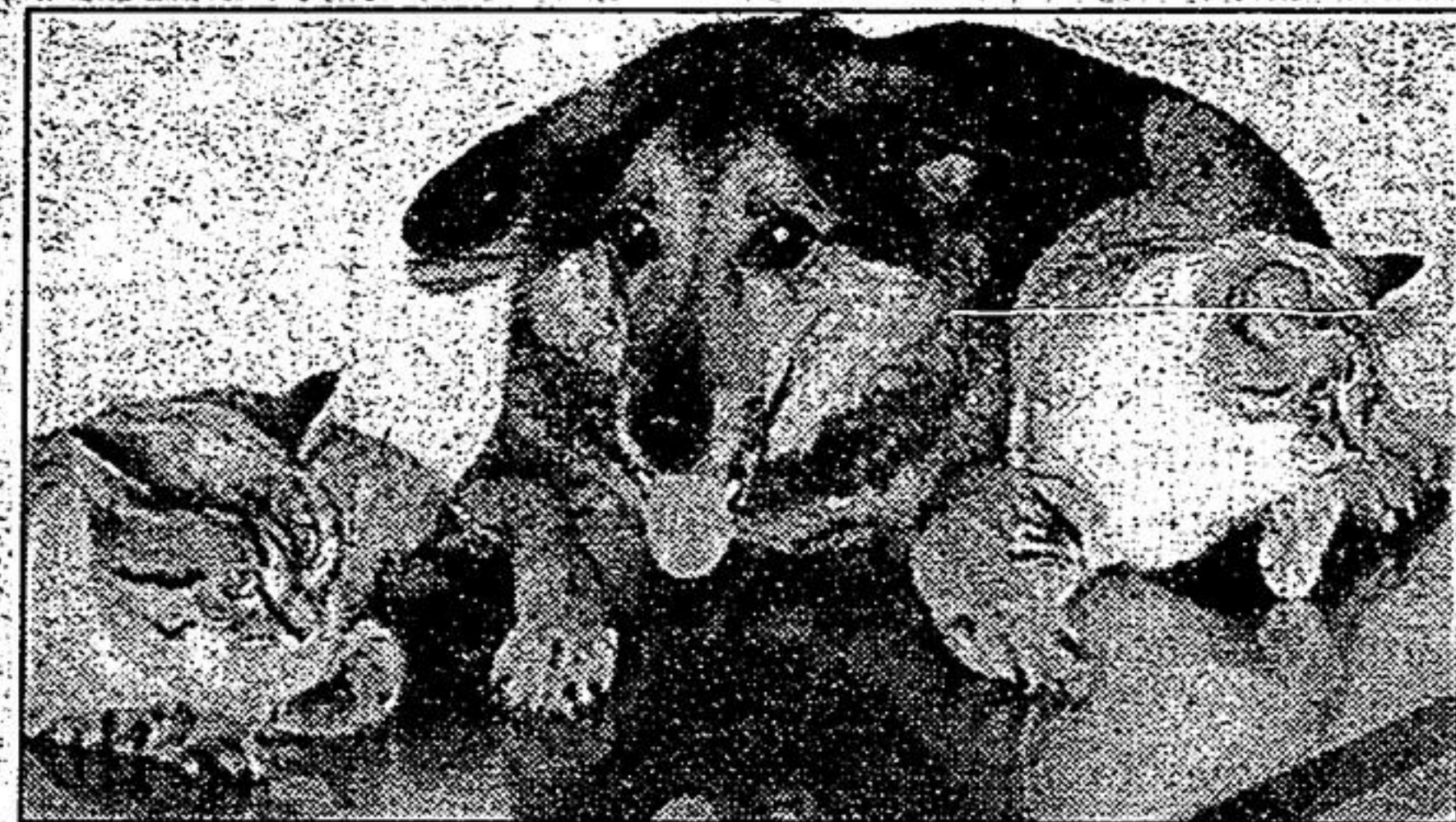
ANIMALS RECOVERING: Dunkley family dog Hermes, centre, and the cats Monty and Mingh were rescued from the Saturday house fire and are recovering at the Stouffville Animal Clinic.

cause of the fire is linked to the storage area at the side of the house.