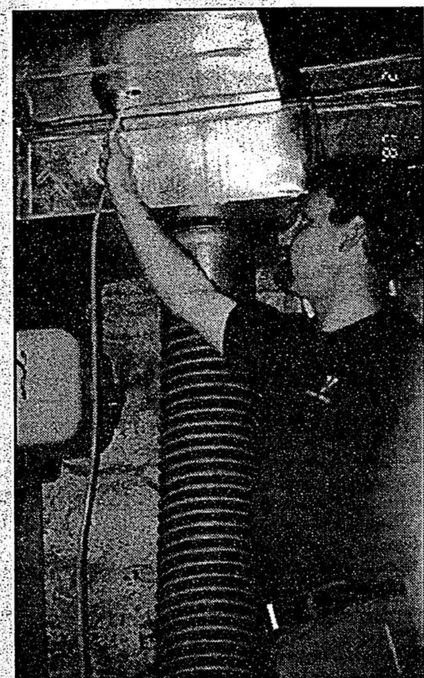
Presently, V Care has a duct cleaning special: $19.95 for the main vent and $6 per vent afterwards.

tomers are getting very good value for their money," said Vaz.