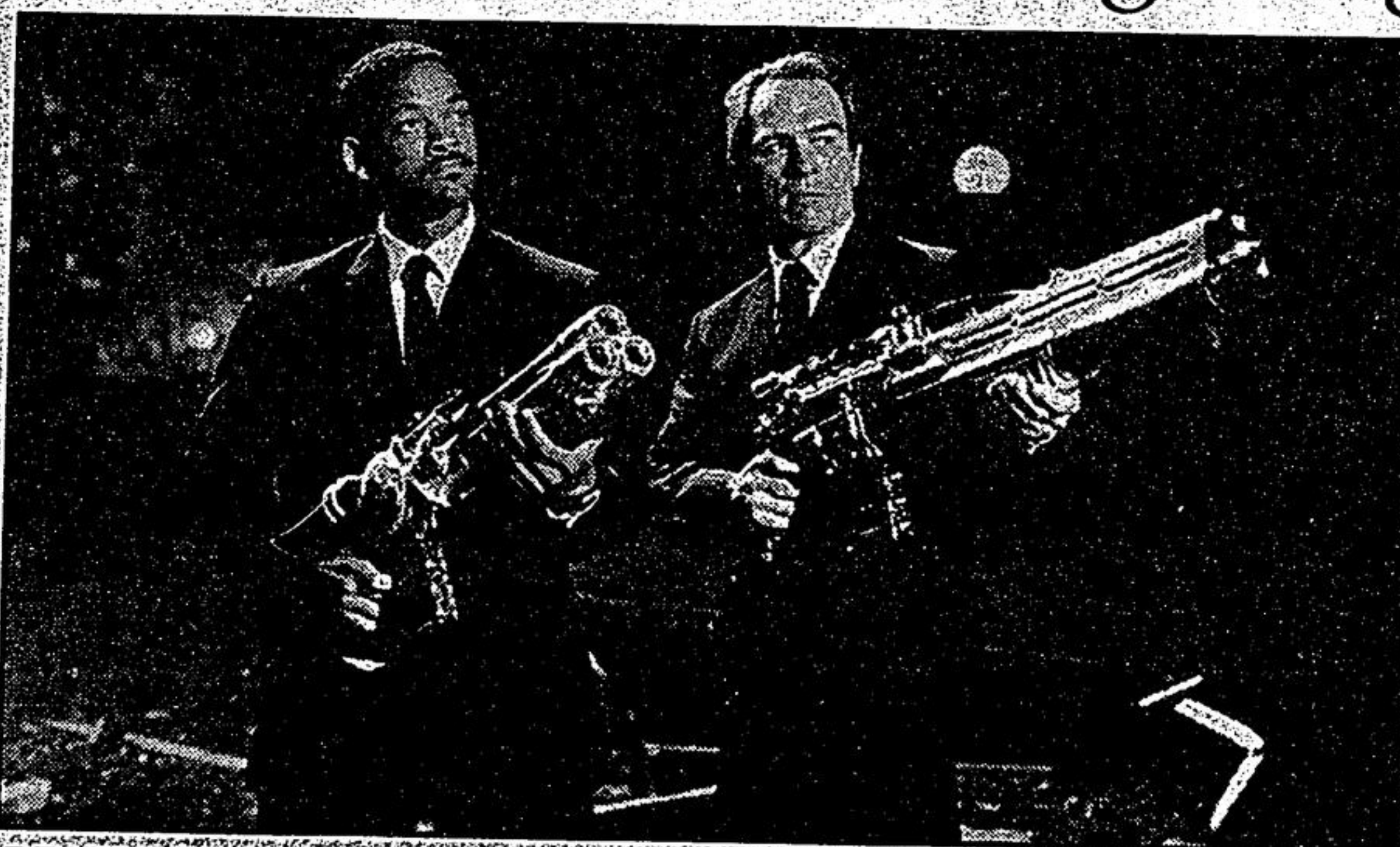
DEADLY AIM: Will Smith and Tommy Lee Jones hunt down alien miscreants.

Tommy Lee Jones and Will Smith star as two mysterious men known only as K and J. They are part of an elite, top secret organi-