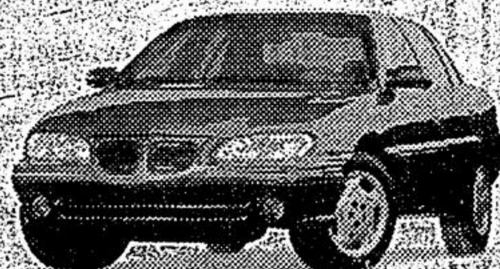
Pontiac Grand Am