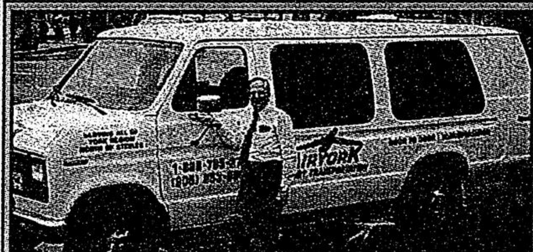
Air York has 12 air conditioned limo vans available

11862 Hwy. 48, 1/2 mile S. of Stouffville Rd., Stouffville 642-5380 WE DELIVER