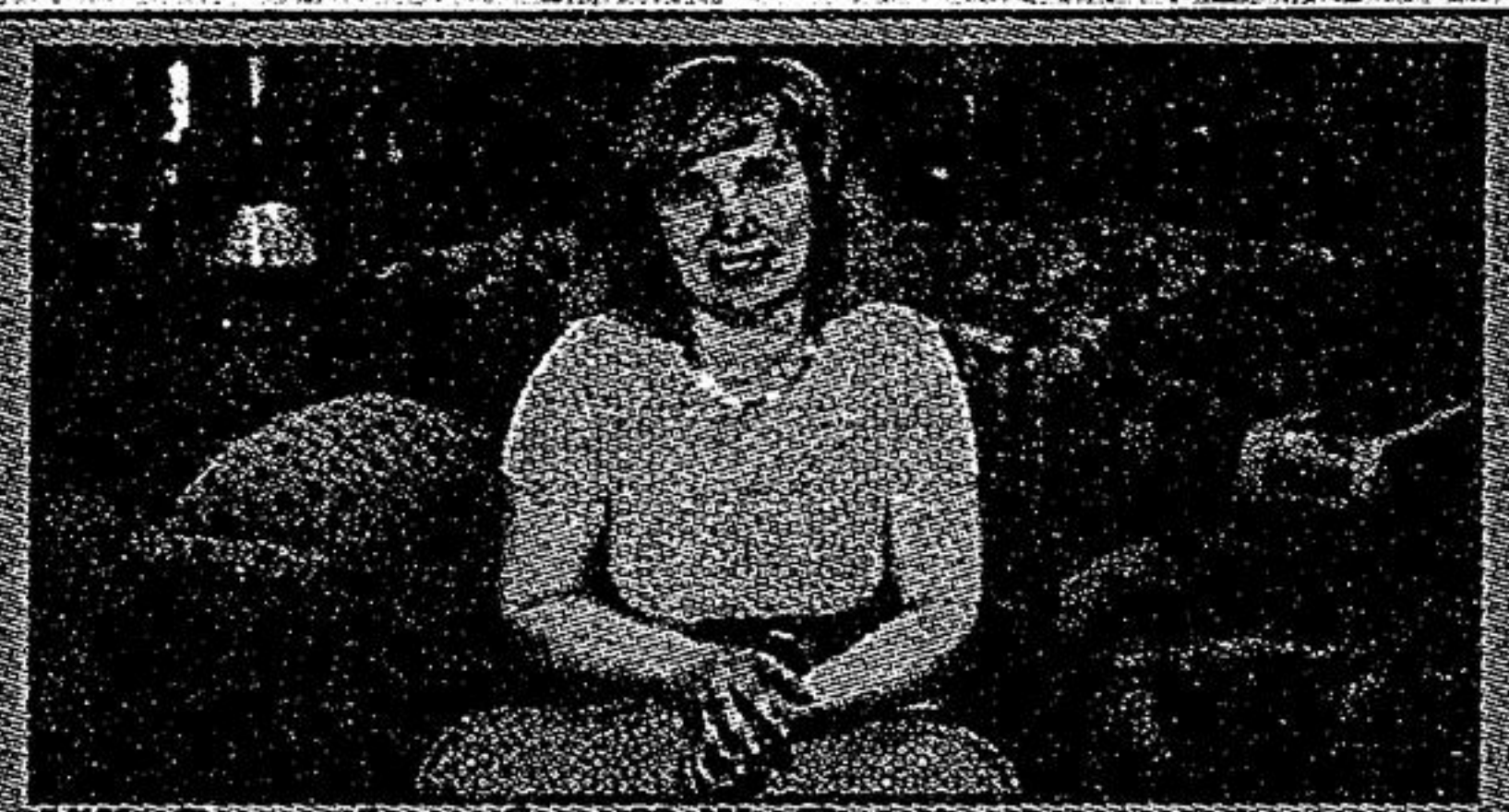
Vile Papas from Stouffville Furniture

For details: 905-953-9980 or call toll free 1-888-795-2777.