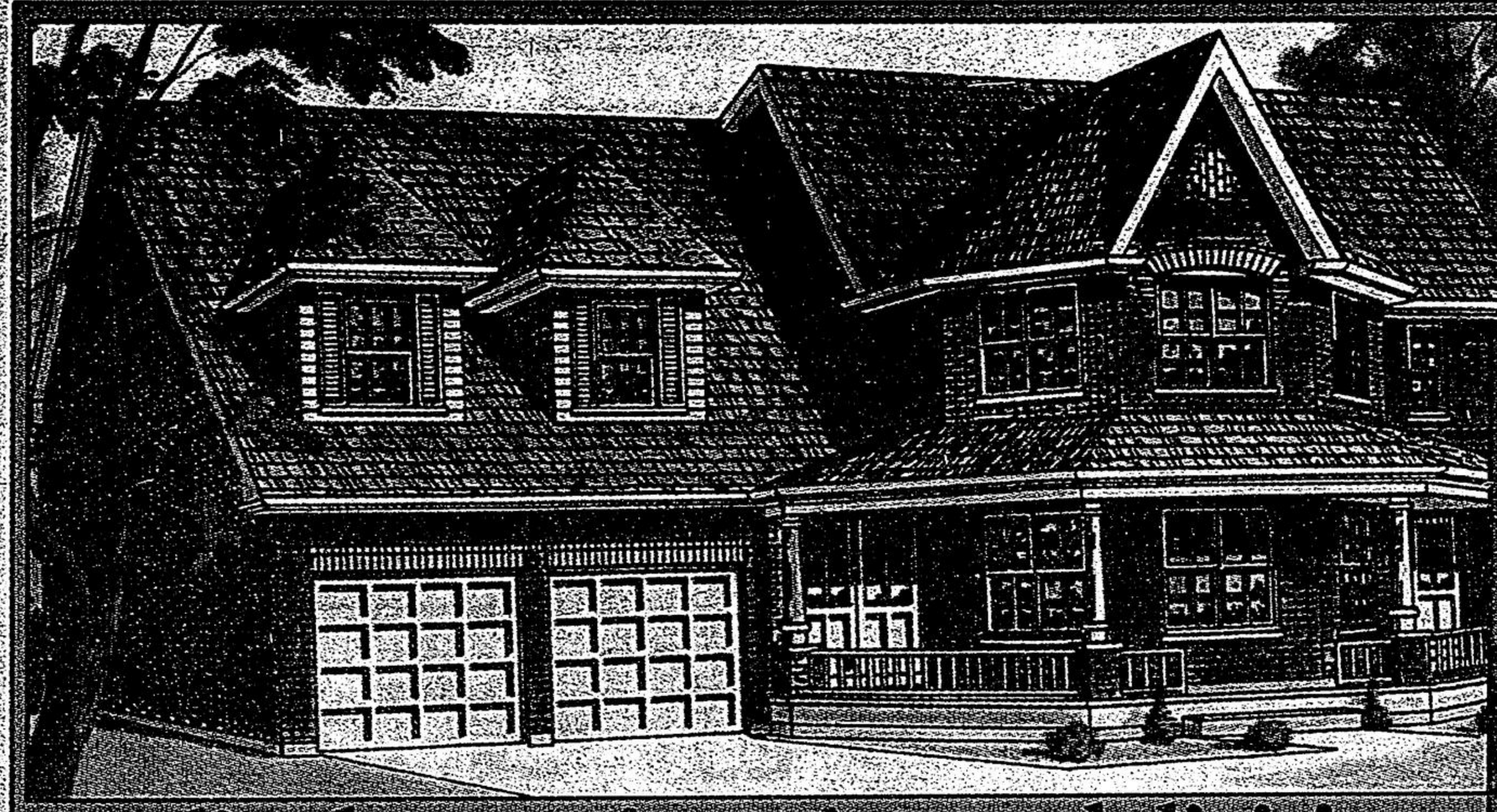
Left - The 3,070 square foot Hibiscus starts at $319,900. It is a four bedroom home with the option of a fifth bedroom. All of the homes can be custom designed so you get everything you want for your dream home (below).