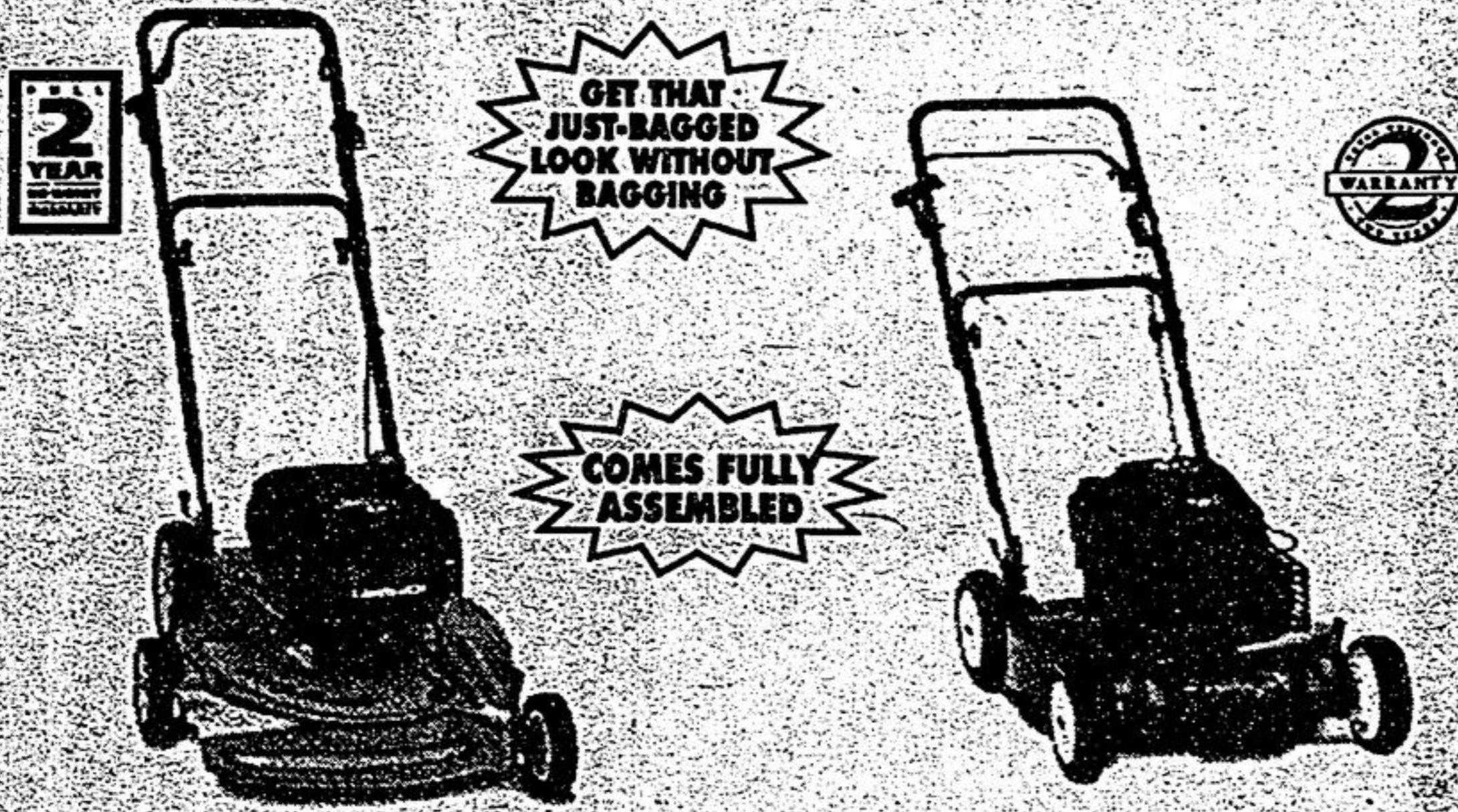
MODEL 10227 MODEL 20449