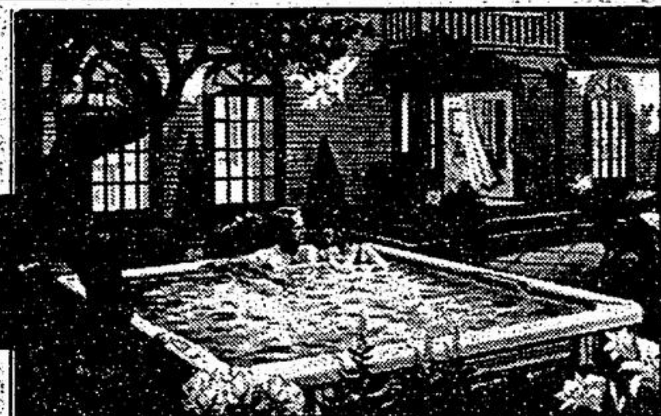
"A fountain of youth in our backyard" - D. Gillis

Using your own private Beachcomber Hot Tub in your backyard is like having a vacation every day! For the cost of just one traditional vacation, you can holiday at home year round! No bags, no tickets, no crowds, just warm, soothing water. Melt away the stress of the day with a new Beachcomber Hot Tub!