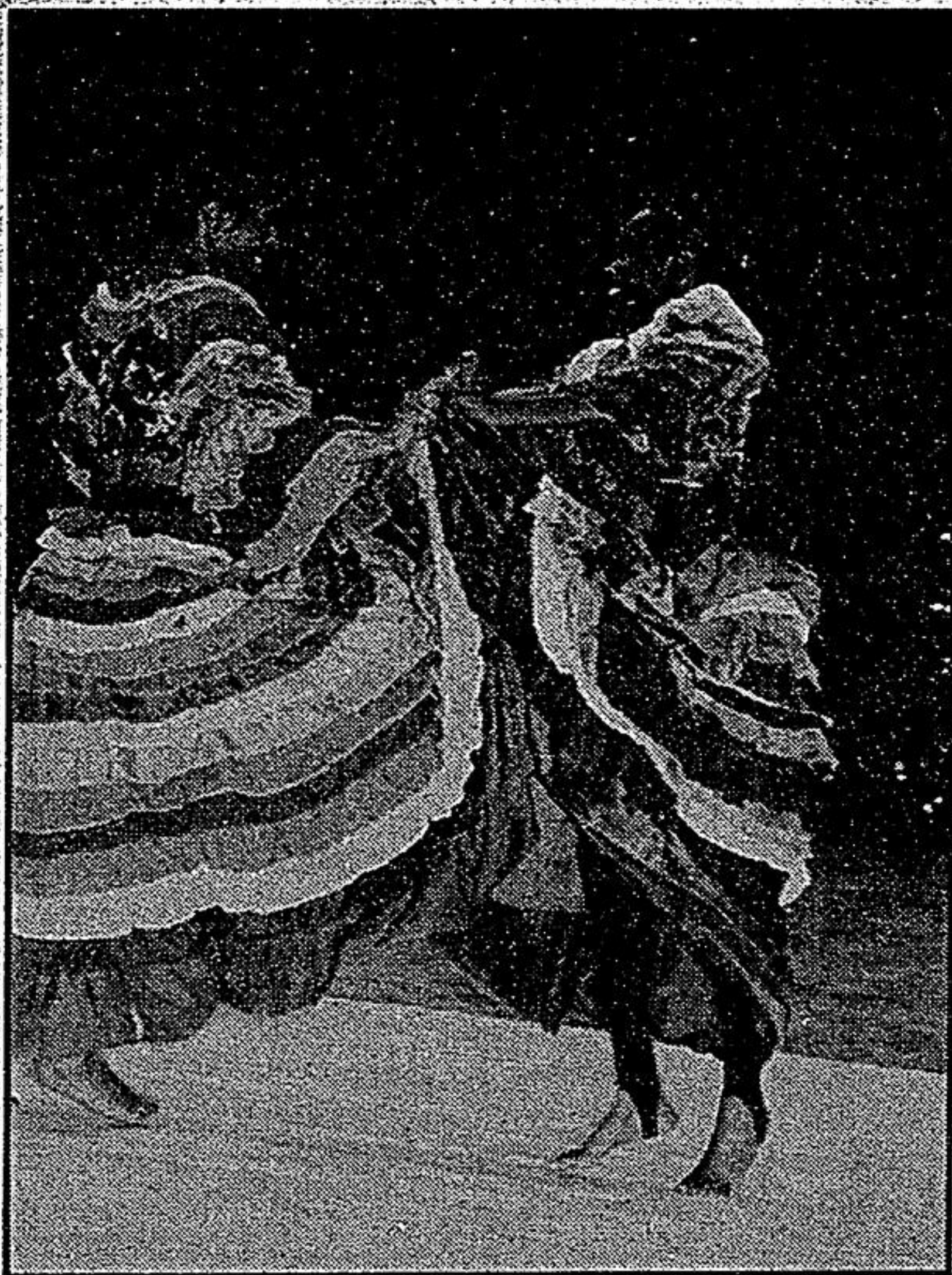
Dancers entertain at last year's Caribbean Festival.