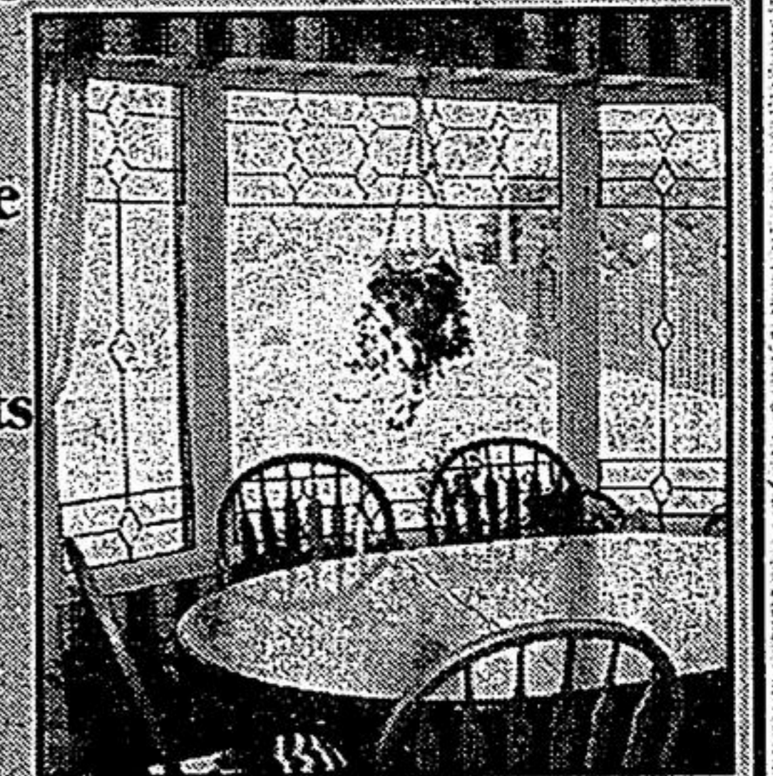
Greenhouse Kitchen Window $435.00*