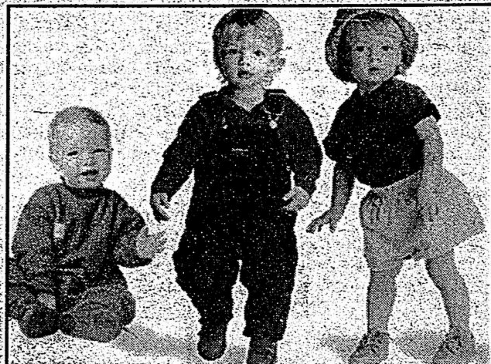
Low-cut leather shoes give children good ankle support as well as allowing their feet to breathe.

Shoes serve two purposes - to give ankle and arch support as well as to protect the feet