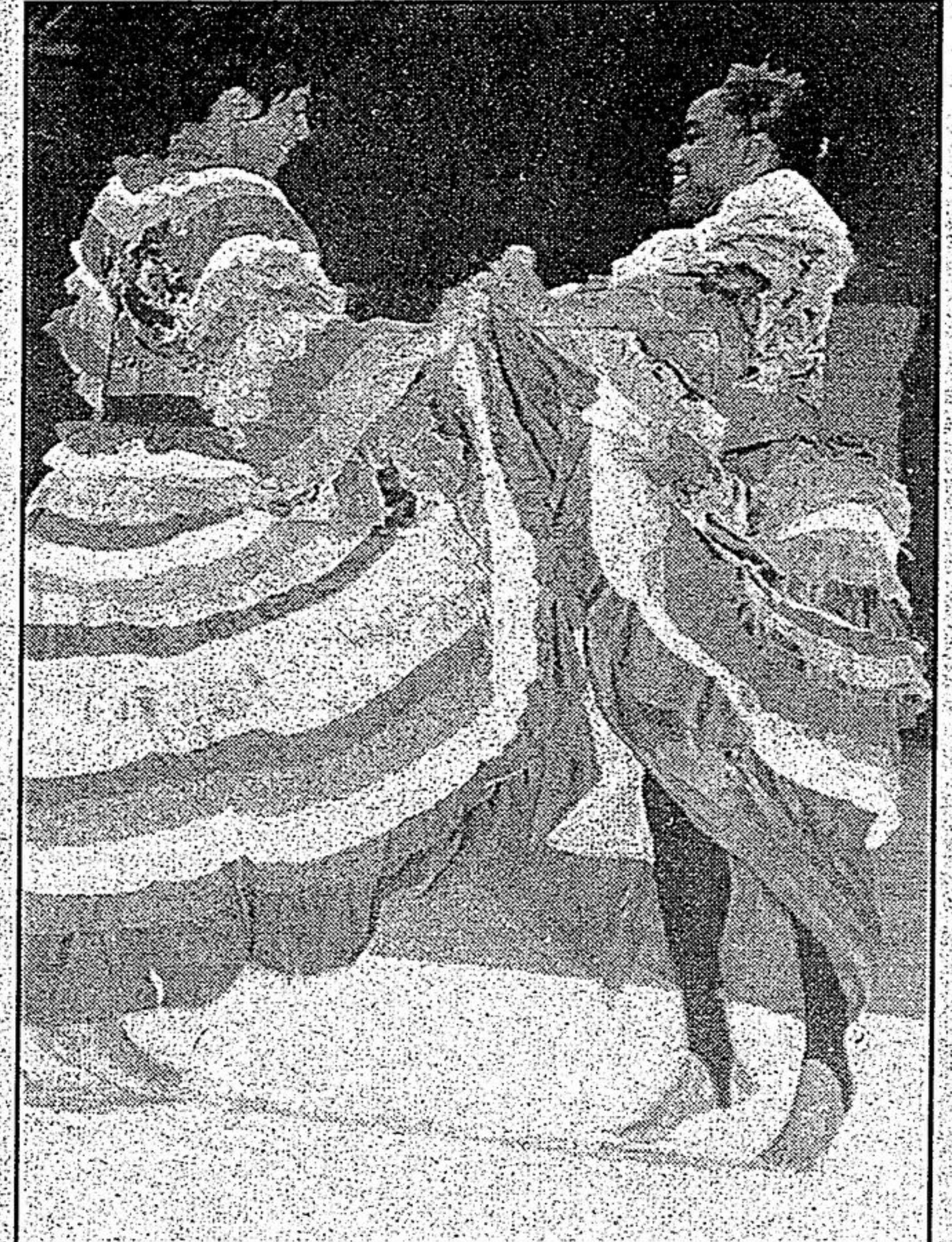
The Caribbean Festival returns to Stouffville with lively costumes and dancing.

The station is a collaboration of the Chamber and local business.