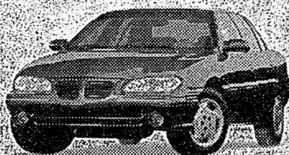
Pontiac Grand Am