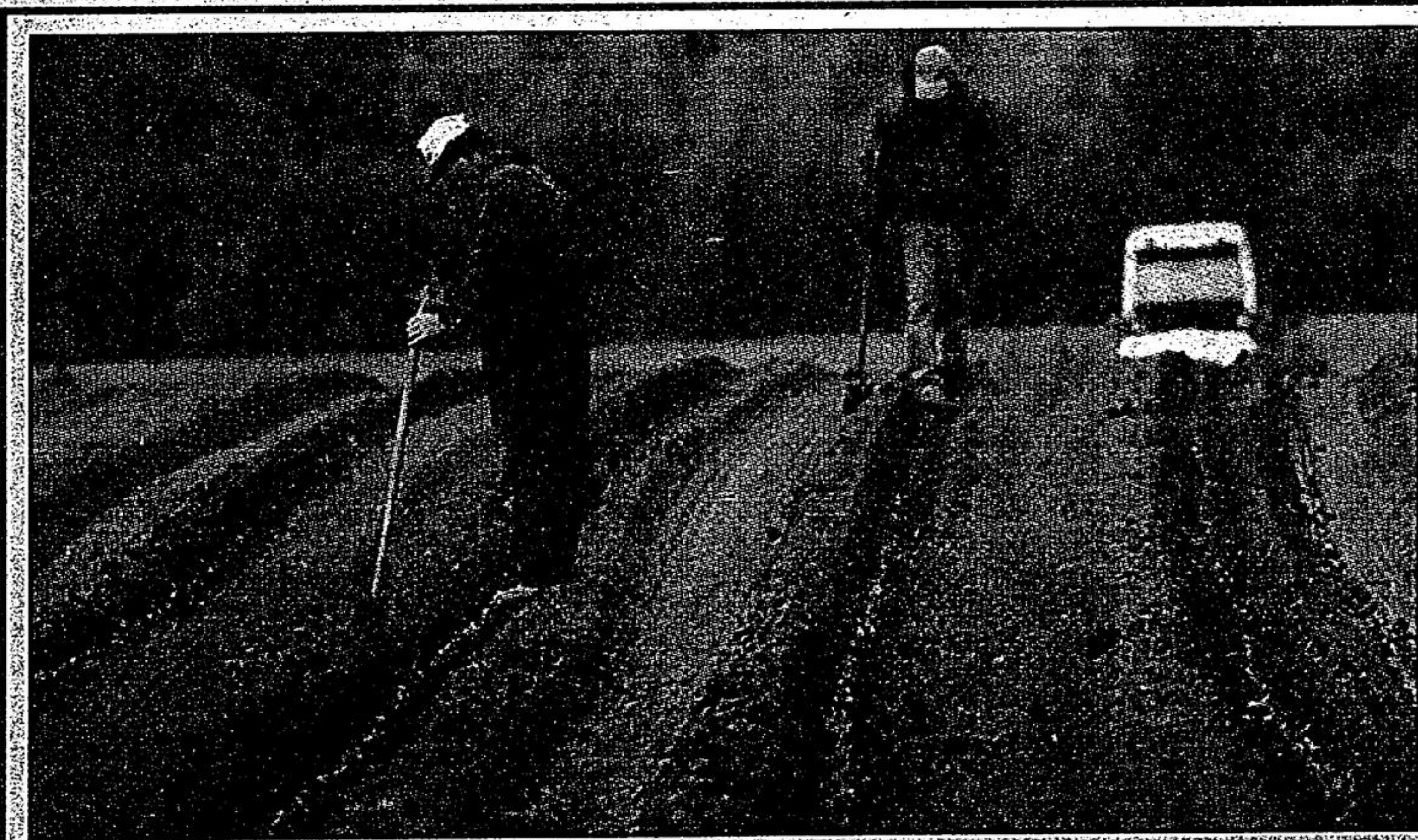
TOUGH ROW TO HOE: Strawberry planters such as these are gearing up for the coming season. Berries are behind this year, because of the cold spring, but there is a warming trend in the forecast.

Watch Thursday's Tribune for a follow-up on the meeting.