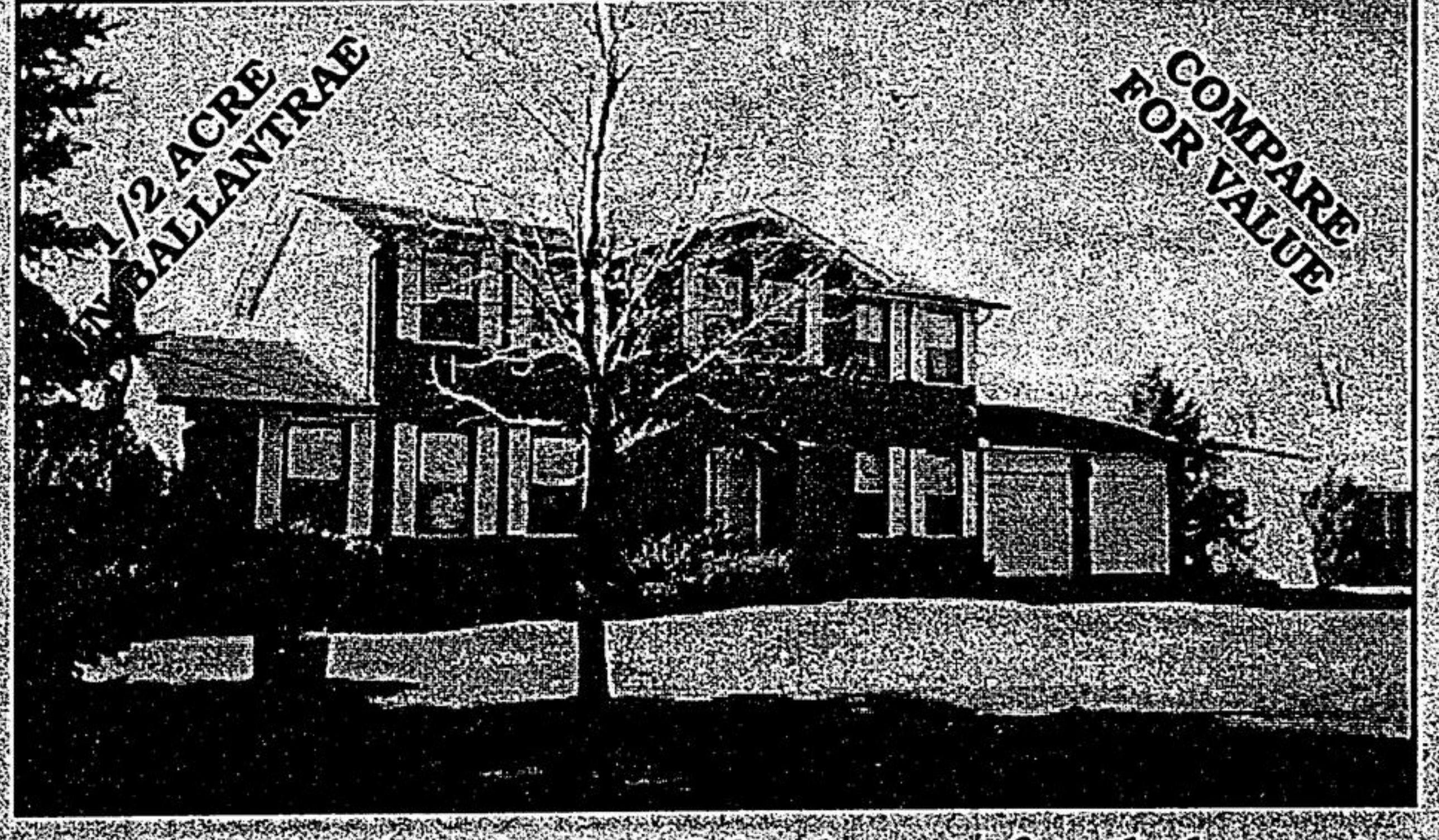
Comfortable 4 bedroom, 3 bathroom family home in "FAMILY-FRIENDLY BALLANTRAE!"

Horses and conservation/recreation areas abound as do excellent public schools and shopping (Aurora, Stouffville and Markham all 10-15 mins.)