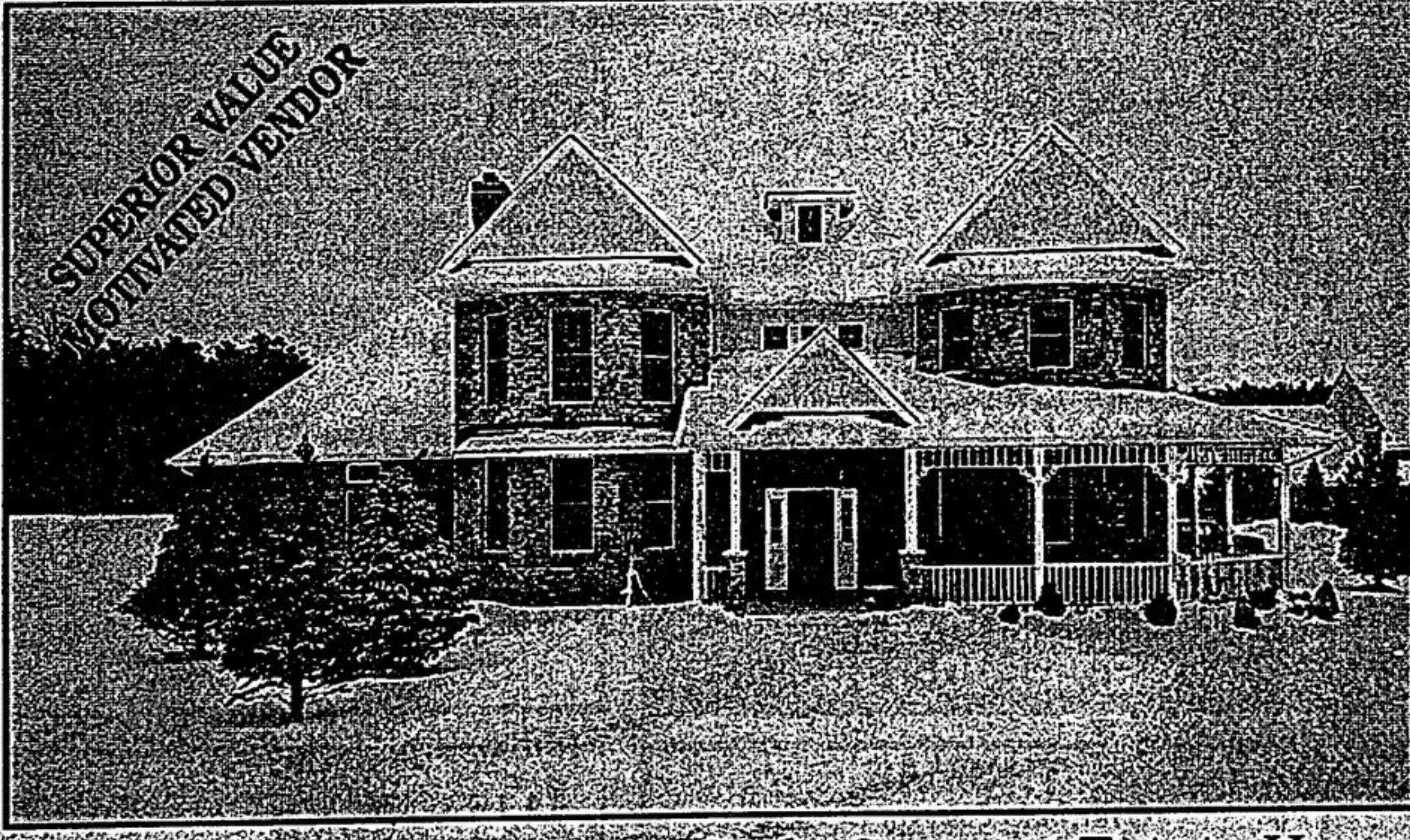
4500 sq. ft. Queen Anne Style Country Estate Home Asking $529,000.