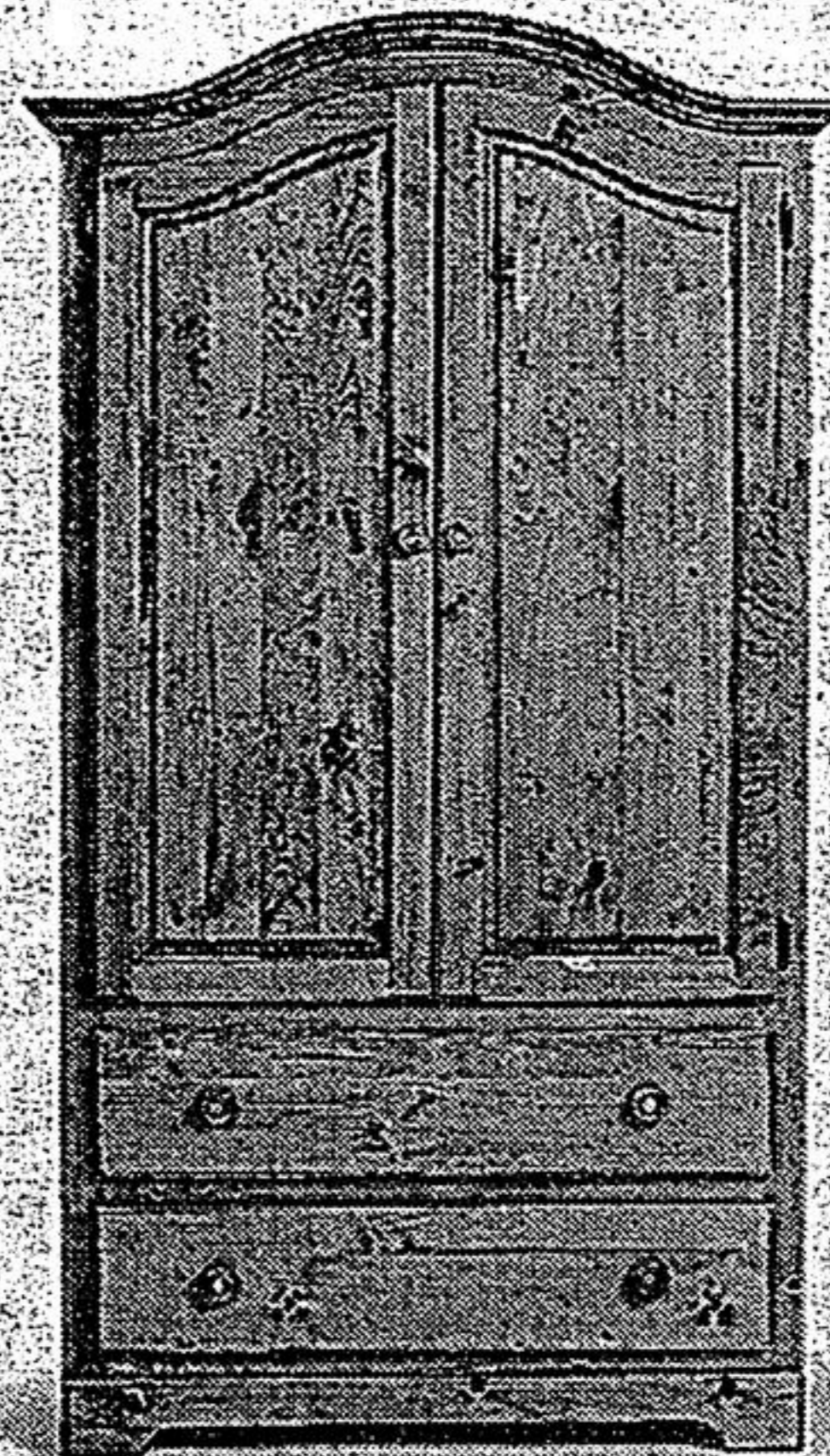
Lakefield Pine Armoire/Entertainment Unit SPECIAL $950

The adjustable shelves behind these doors can hide a TV and audio system as easily as stacks of sweaters and socks. And like all Woodcraft armoires, the Lakefield can be ordered with a wide range of custom features and special finishes.