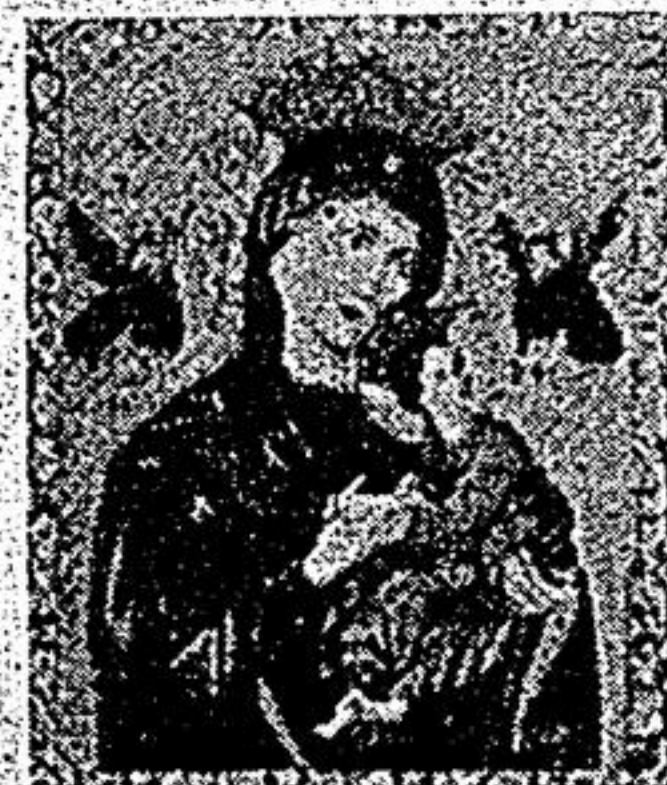
Our Mother of Perpetual Help

Holy Spirit. Thou make me see everything and show me the way to reach my ideal. You who give the divine gift to forgive and forget the wrong that is done to me and who are in all instances of my life with me. I, in this short dialogue, want to thank You for everything and confirm once more that I never want to be separated from You no matter how great the material desire may be. I want to be with You and my loved ones in Your perpetual glory. Amen. Person must pray this 3 consecutive days without stating one's wish. After the 3rd day your wish will be granted no matter how difficult it may be. Promise to publish this as soon as your favour has been granted.