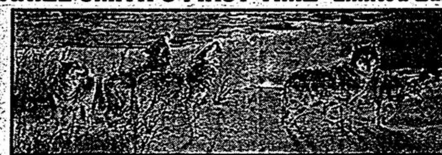
"MOON SONG" 20"x30" A Time-Limited Edition Print

Print only - $295 00 ~ SPECIAL $395 00 framed accompanied by an Earth Day Commemorative Stamp ORDER DEADLINE - APRIL 28, 1997 ORDER DEPOSIT REQUIRED