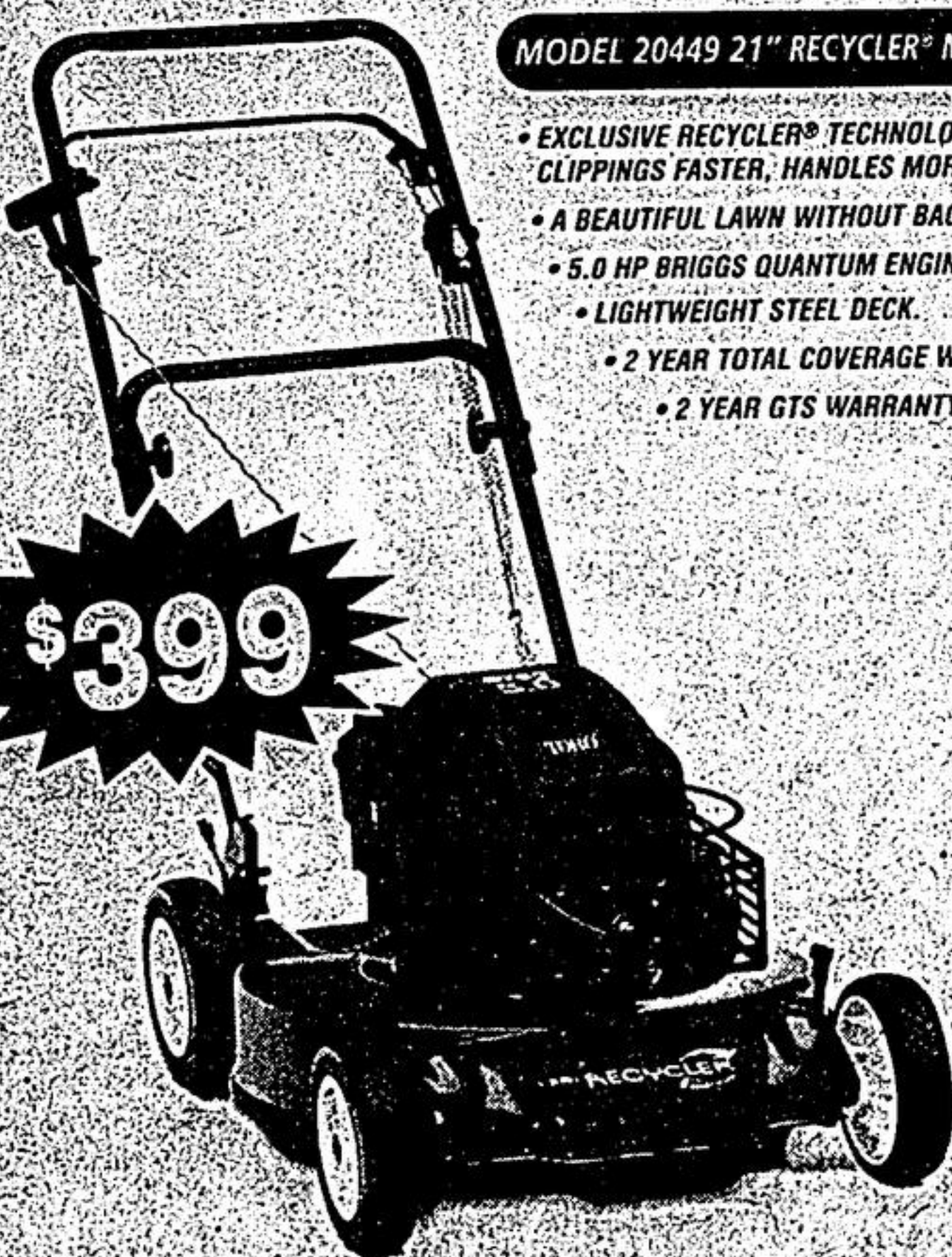
MODEL 20449 21" RECYCLER® MOWER

No Payments, No Interest Until October 1997