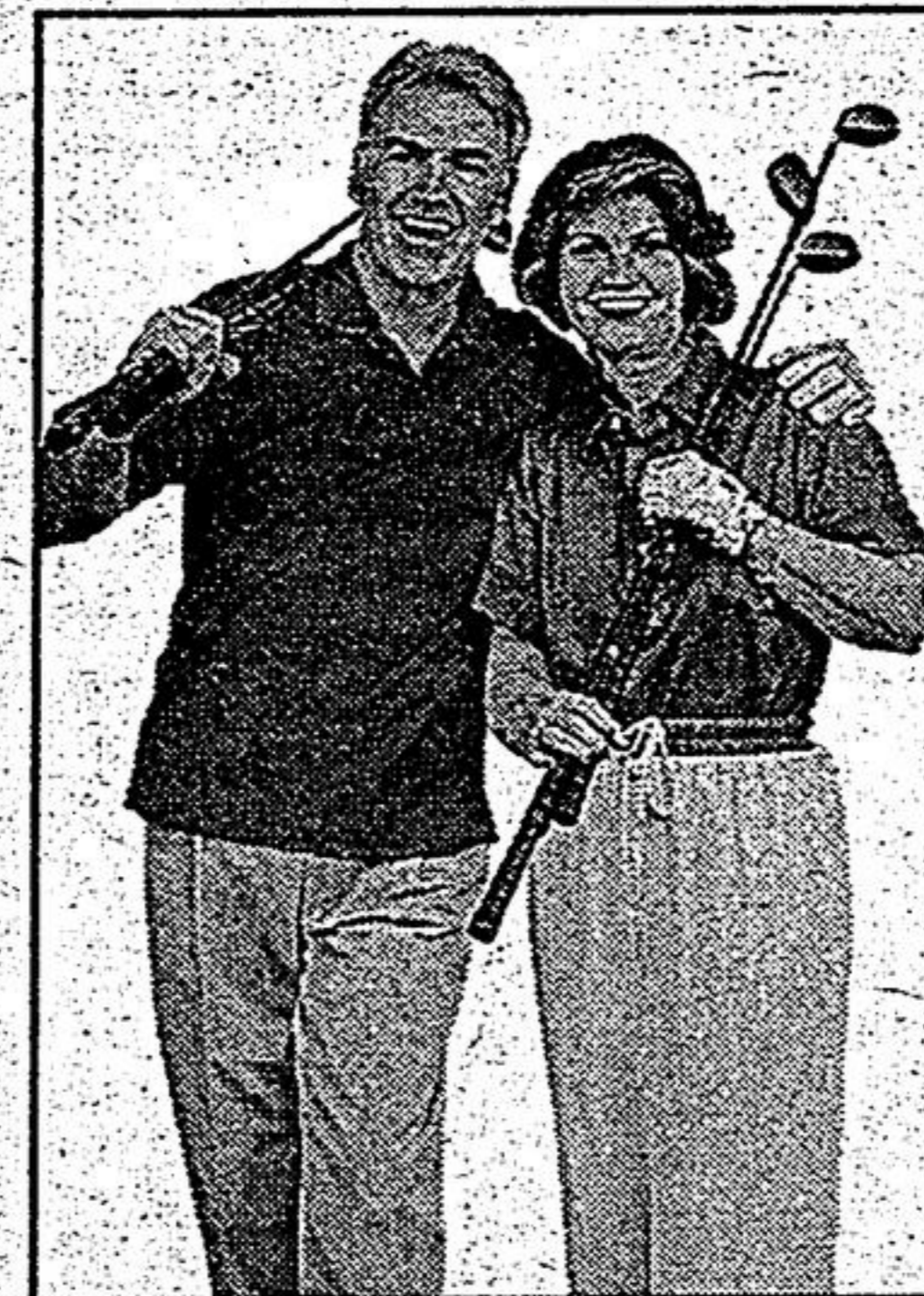
To avoid frustrations, take lessons before heading out to the golf course for the first time.