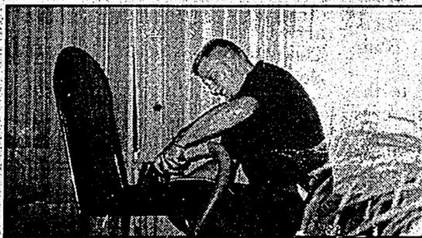
Staff at V Care Inc. are professionally trained to clean upholstery and carpets in the home.