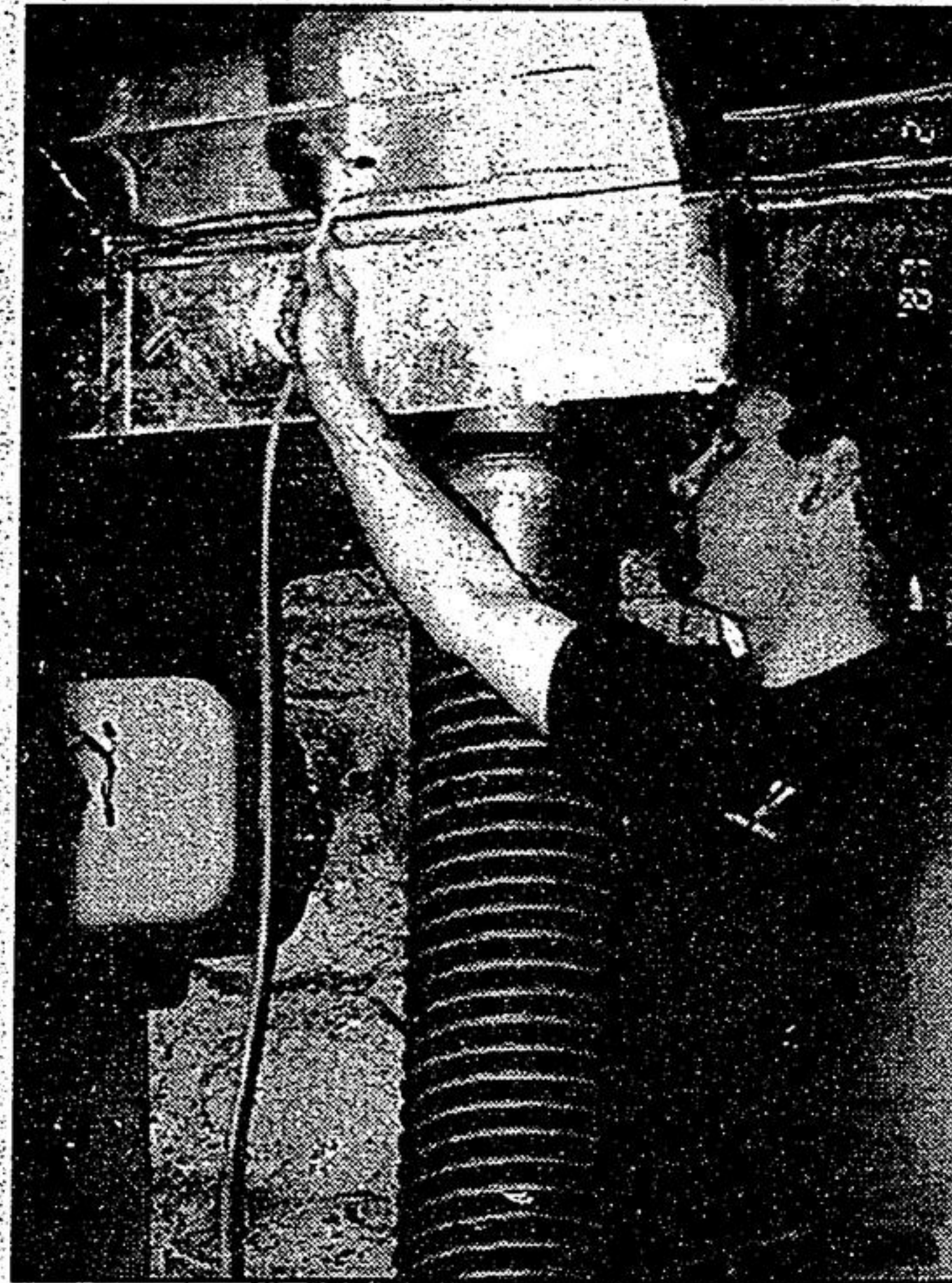
V Care Inc. uses the snake method to clean the ducts in people's home.

"We keep abreast with new technologies as manufacturers' requirements change."