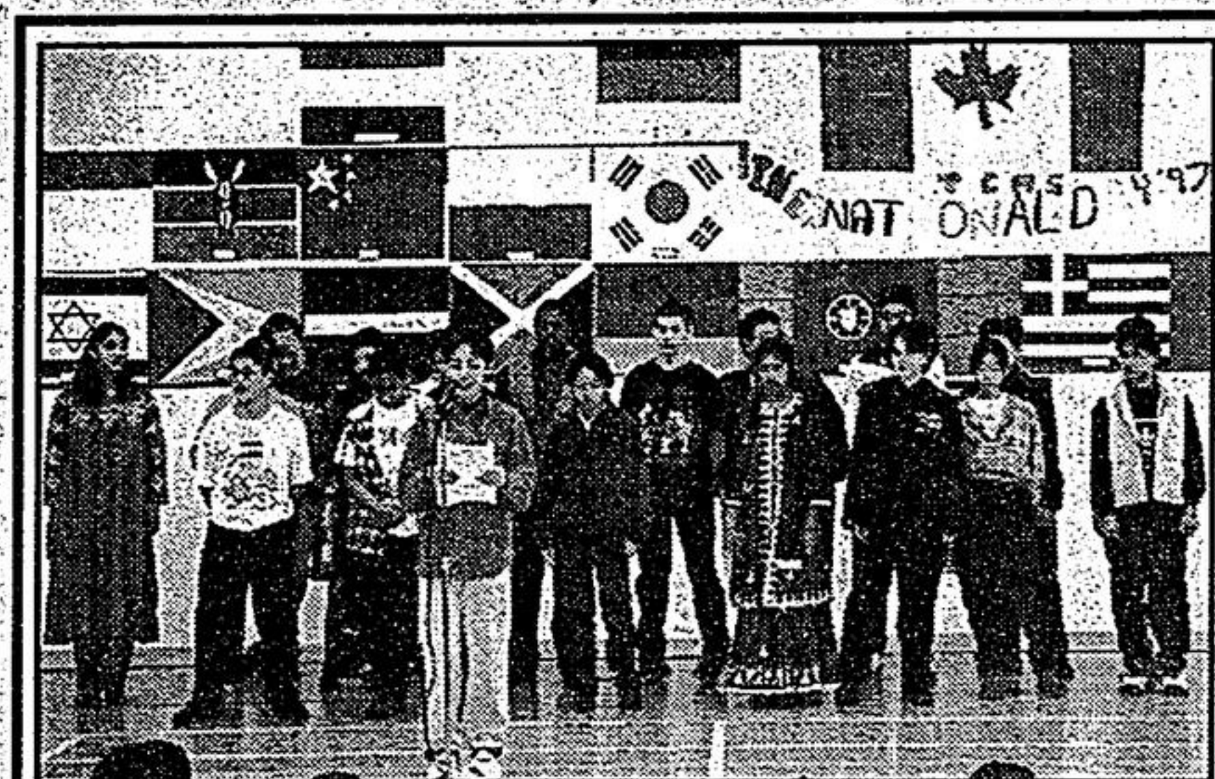
Town Centre Montessori Private School students from JK to OAC gathered together for their annual International Day assembly on Friday, March 7th. Celebrating their multicultural backgrounds through songs, dances and speeches, students expressed their sentiments through the theme "Celebrating our Culture as Canadians". Students decorated the gymnasium in their beautiful new campus (recently opened earlier this year) with hand-made flags from every country represented by the student body.