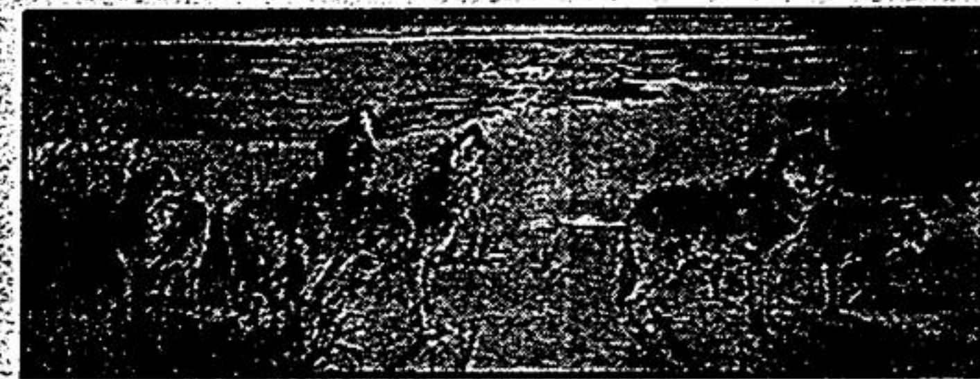
"MOON SONG" 20"x30"