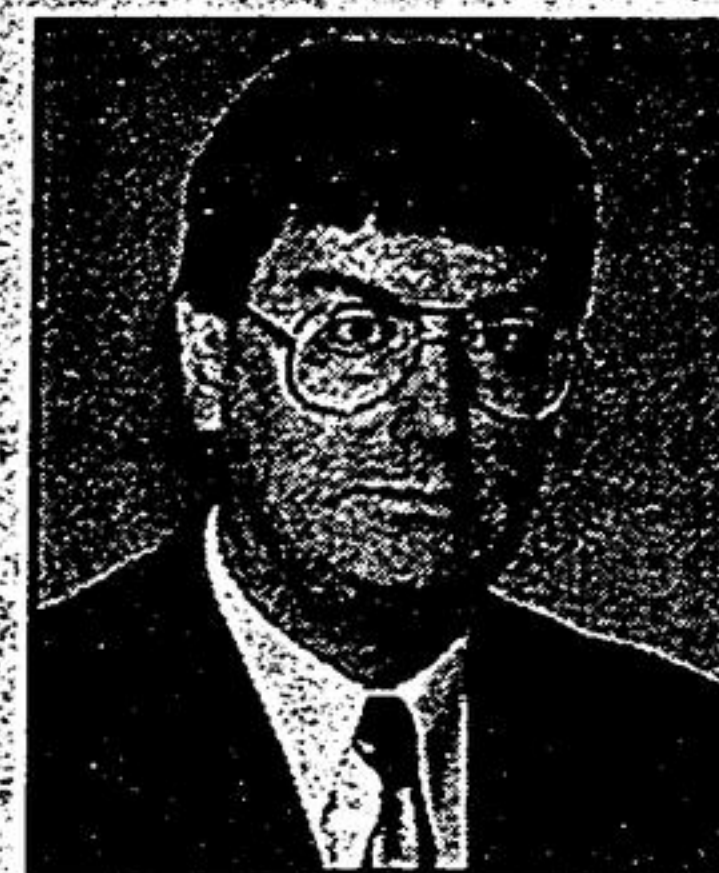
Markham business owner. Member of Markham Board of Trade & York Tech