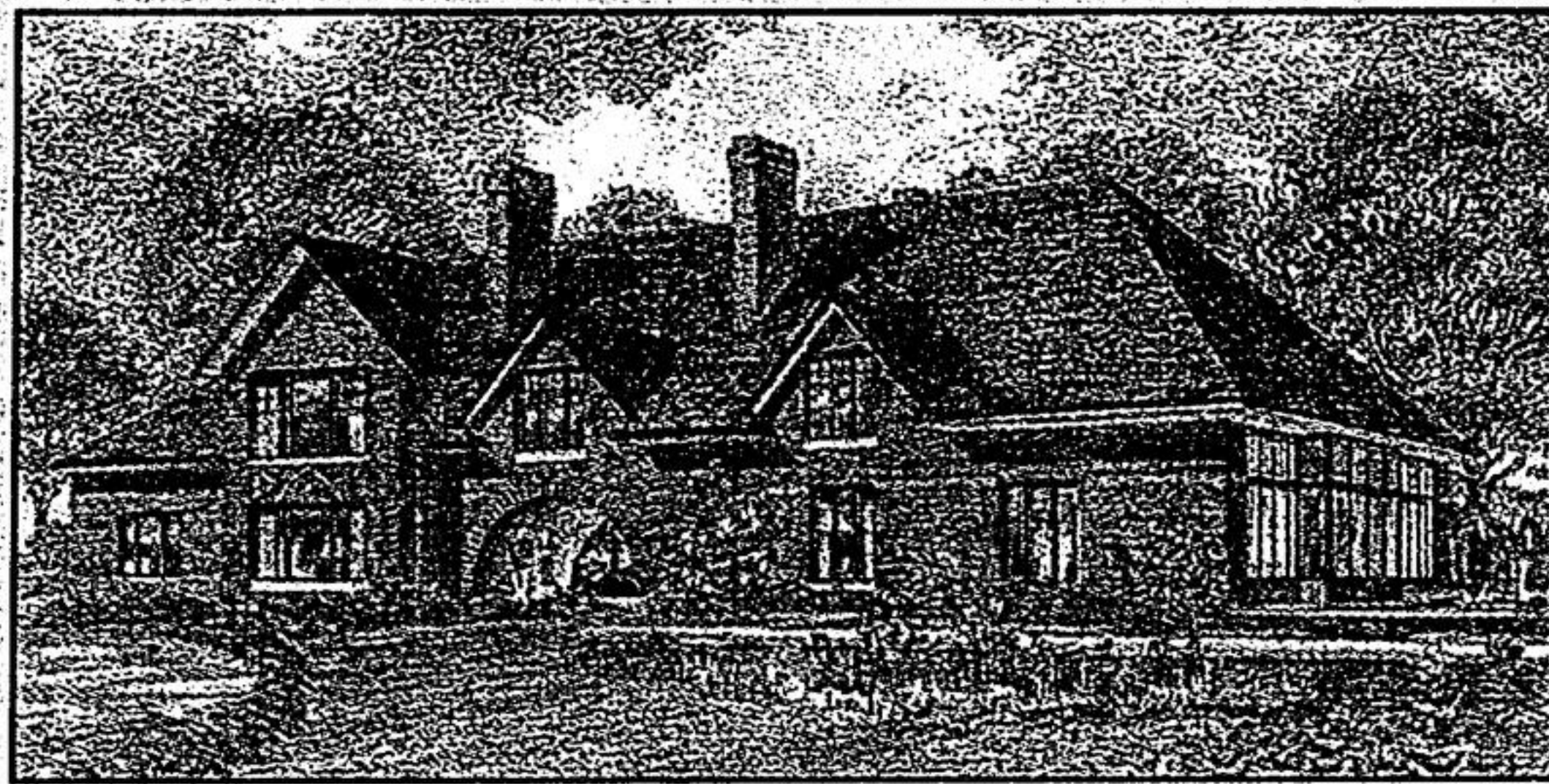
A model of the clubhouse for the proposed Ballantrae Golf and Country Club. The public can view all the plans on April 1 in Ballantrae.

Whitchurch-Stouffville Council gave the proposal a "wow" response when it was unveiled Tuesday. Meanwhile, the plan will go under public scrutiny very soon—The Forhan Group, acting on behalf of developer Schickedanz Bros. Ltd., will host a public information meeting on April 1 at 7 p.m. at the Ballantrae Community Centre. The ball for one of the largest developments in Whitchurch