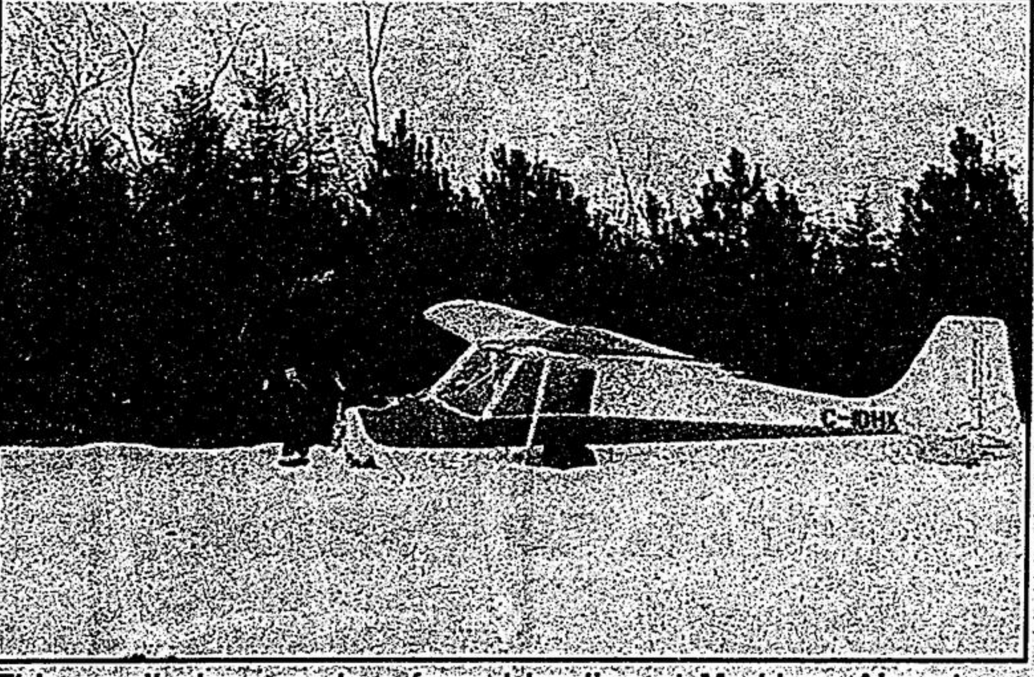
This small plane made a forced landing at Markham Airport on Thursday.

Officials at Markham Airport declined comment on the incident.