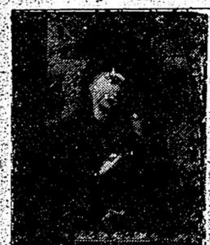
Our Mother of Perpetual Help M.M.

Holy Spirit Thou make me see everything and show me the way to reach my ideal. You who give the divine gift to forgive and forget the wrong that is done to me and who are in all instances of my life with me. I, in this short dialogue, want to thank You for everything and confirm once more that I never want to be separated from You no matter how great the material desire may be. I want to be with You and my loved ones in Your perpetual glory. Amen. Person must pray this 3 consecutive days without stating one's wish. After the 3rd day your wish will be granted no matter how difficult it may be. Promise to publish this as soon as your favour has been granted.