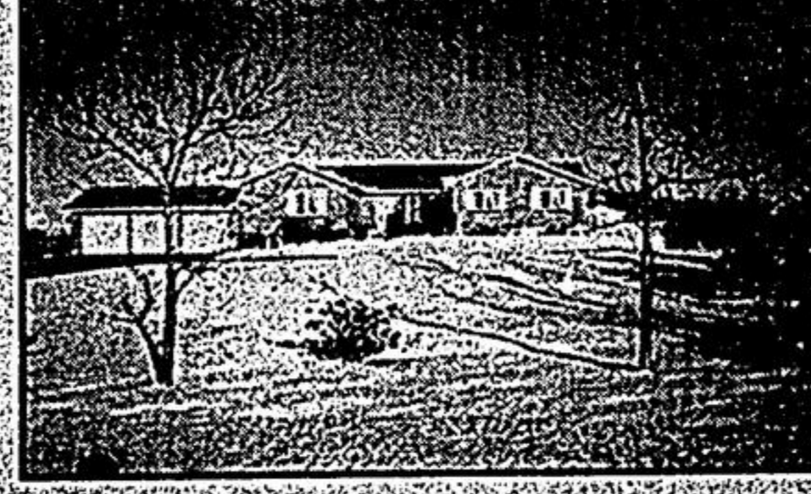
5 BDRM. EXECUTIVE