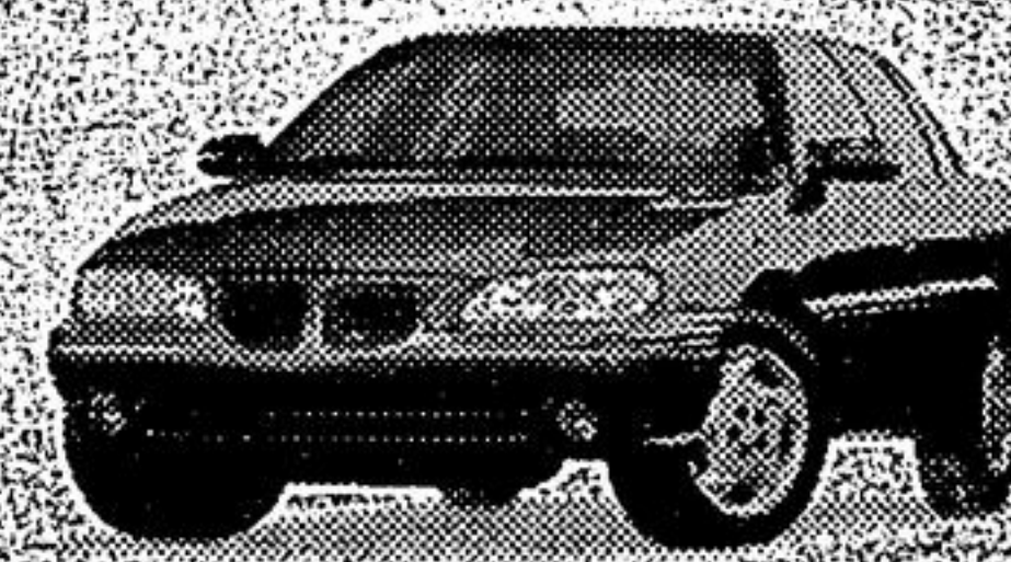
Pontiac Grand Am Sedan