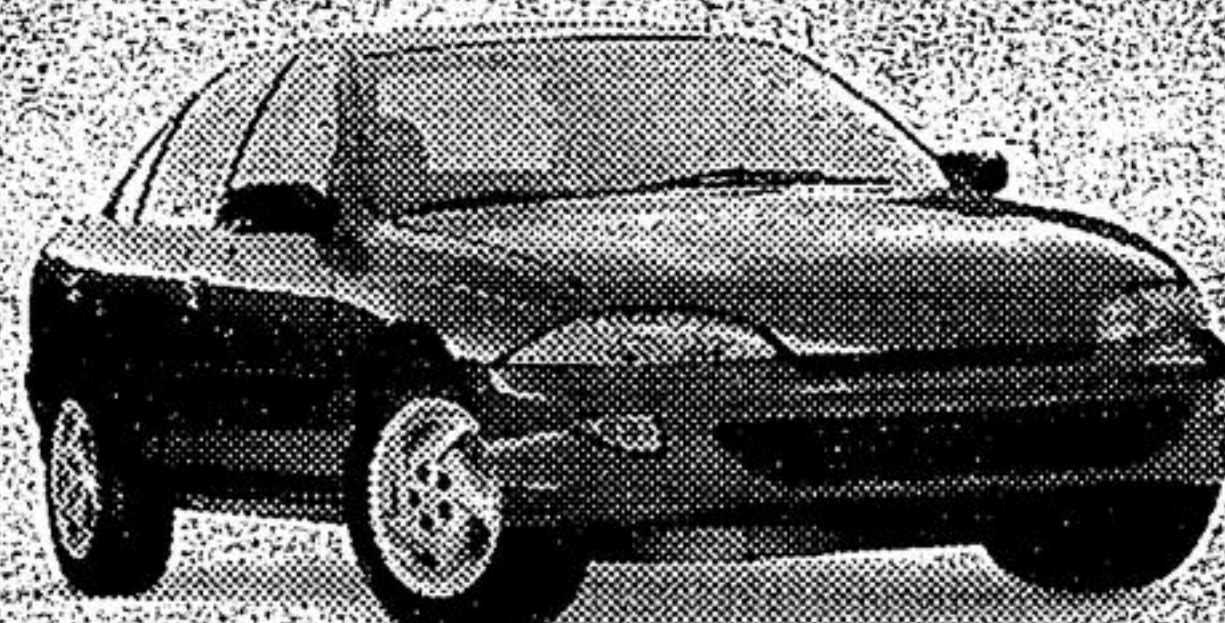
Chevrolet Cavalier Sedan (Canada's #1 Selling Car)