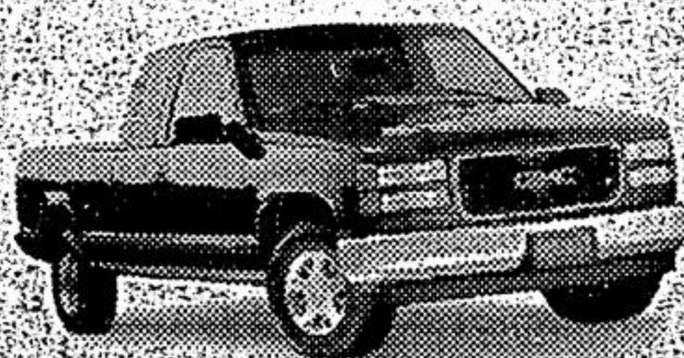
GMC Extended Cab