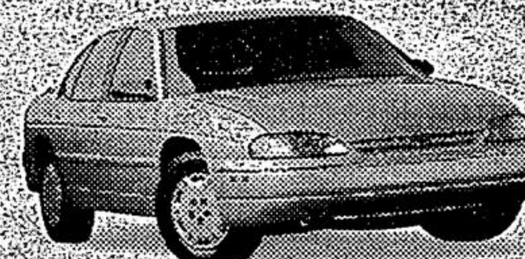
Chevy Lumina Sedan