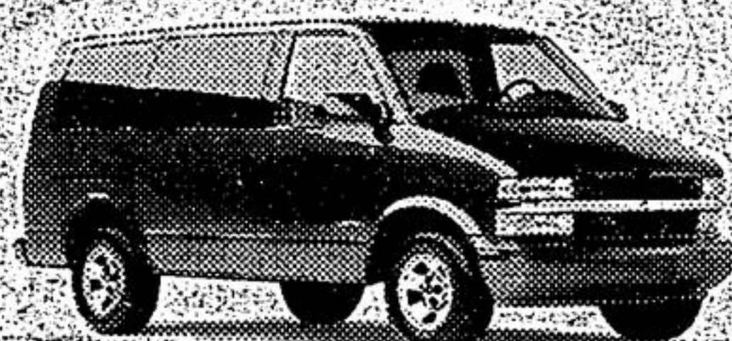
Chevy Astro Van

Get 3.9% Value Financing on ALL '96 and '97 GM vehicles in stock.