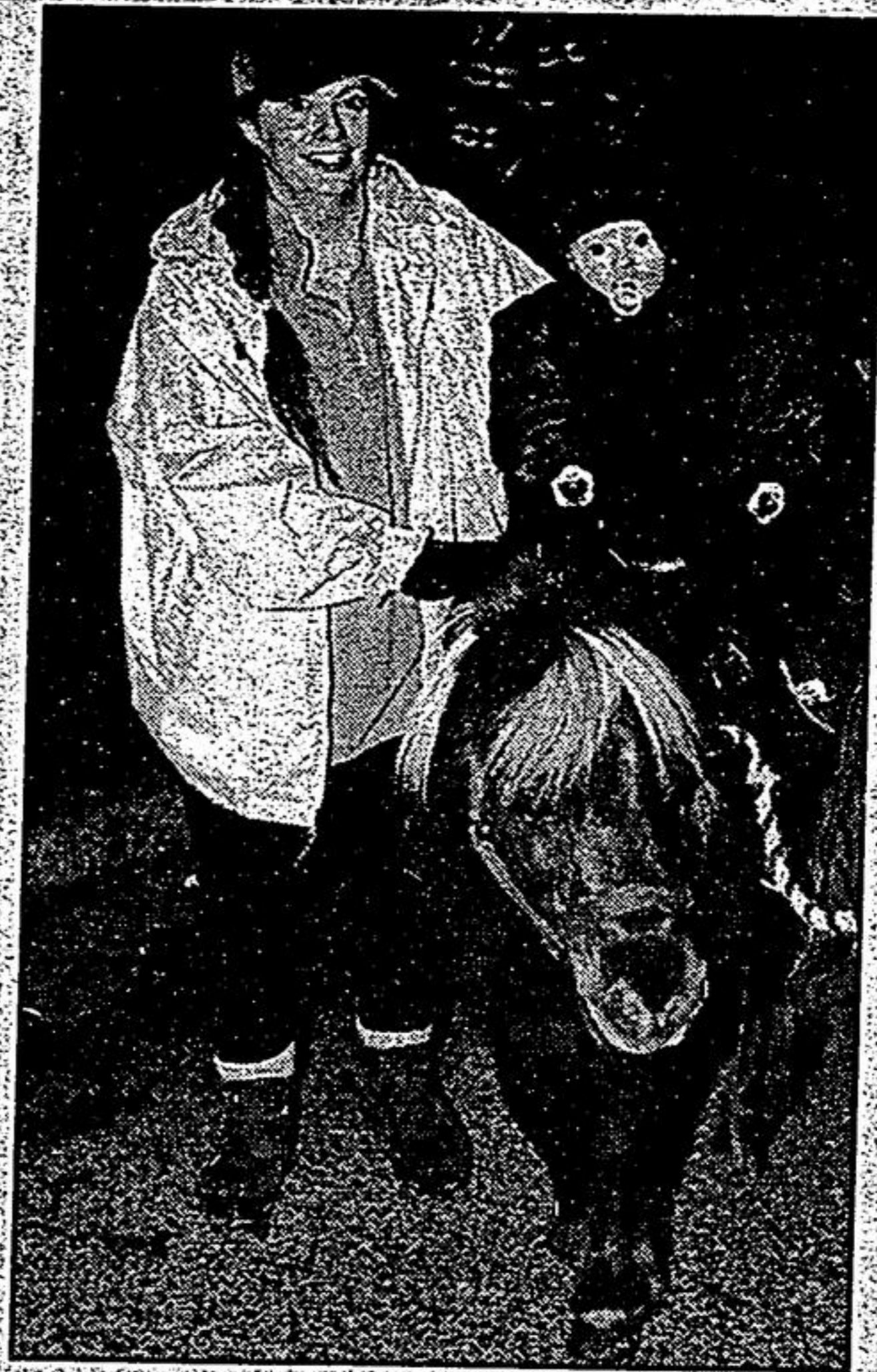
Pony rides will also be available near the petting zoo on festival night, weather permitting.

The menagerie will include miniature goats, chinese chickens, barnyard ducks, rabbits, a pony, zebu, Cecilian donkeys, young camel, lambs, Jacob sheep and some young South American llamas.