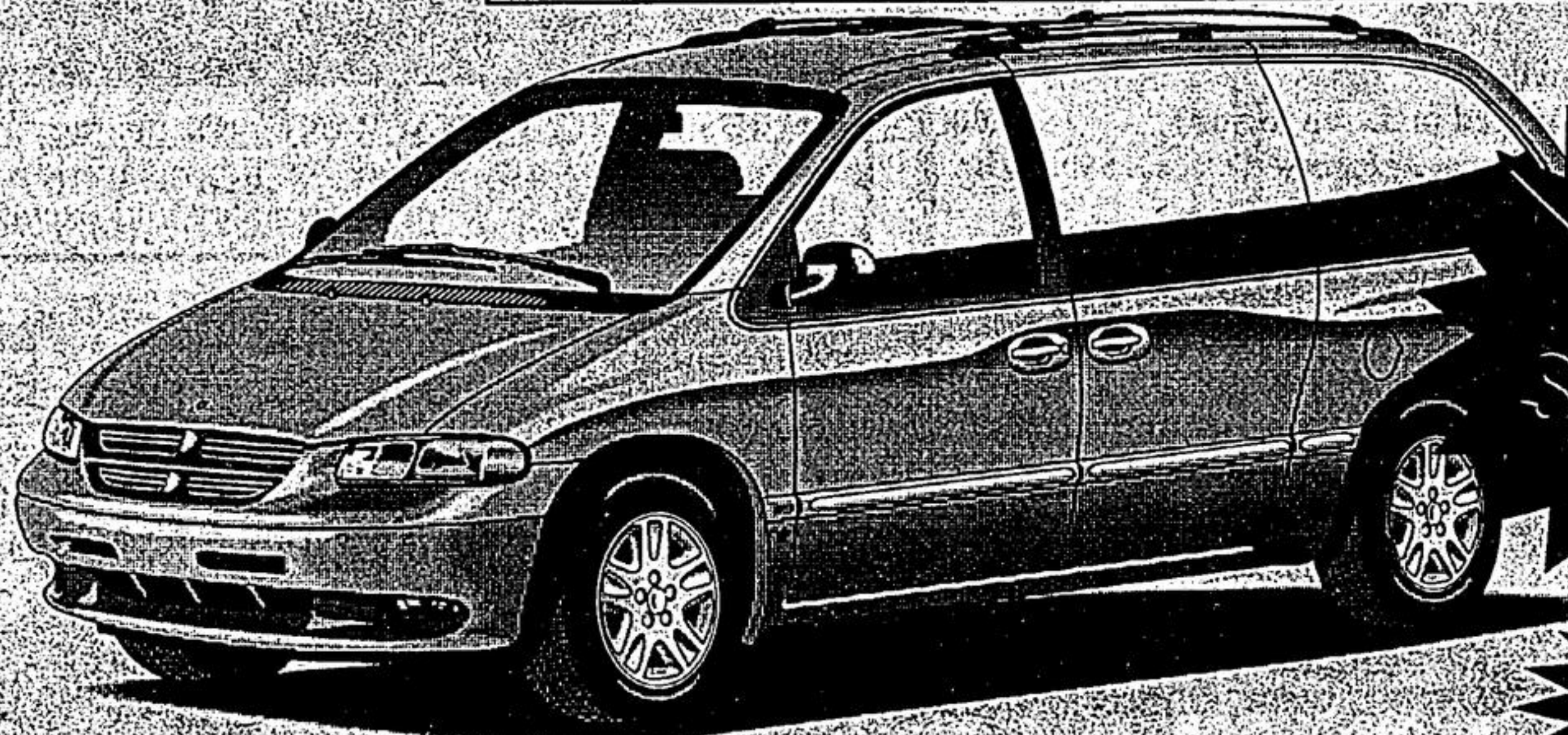
1996 DODGE CARAVAN

SERVICE LOYALTY PROGRAM CHECKBOOK. *All prices reflect rebates assigned to dealer, plus freight and all applicable taxes, leases calculated with freight and all taxes as down payment. Ask dealer for full details.