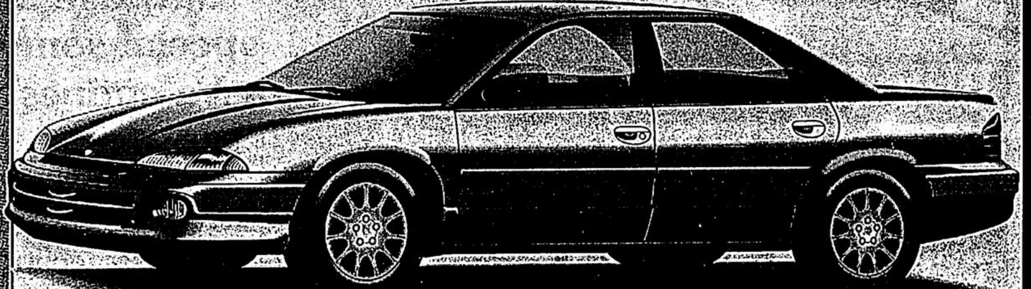
1996 CHRYSLER INTREPID

SALE $18,965* Or Lease $299.00, 36 month lease, $1000 down payment