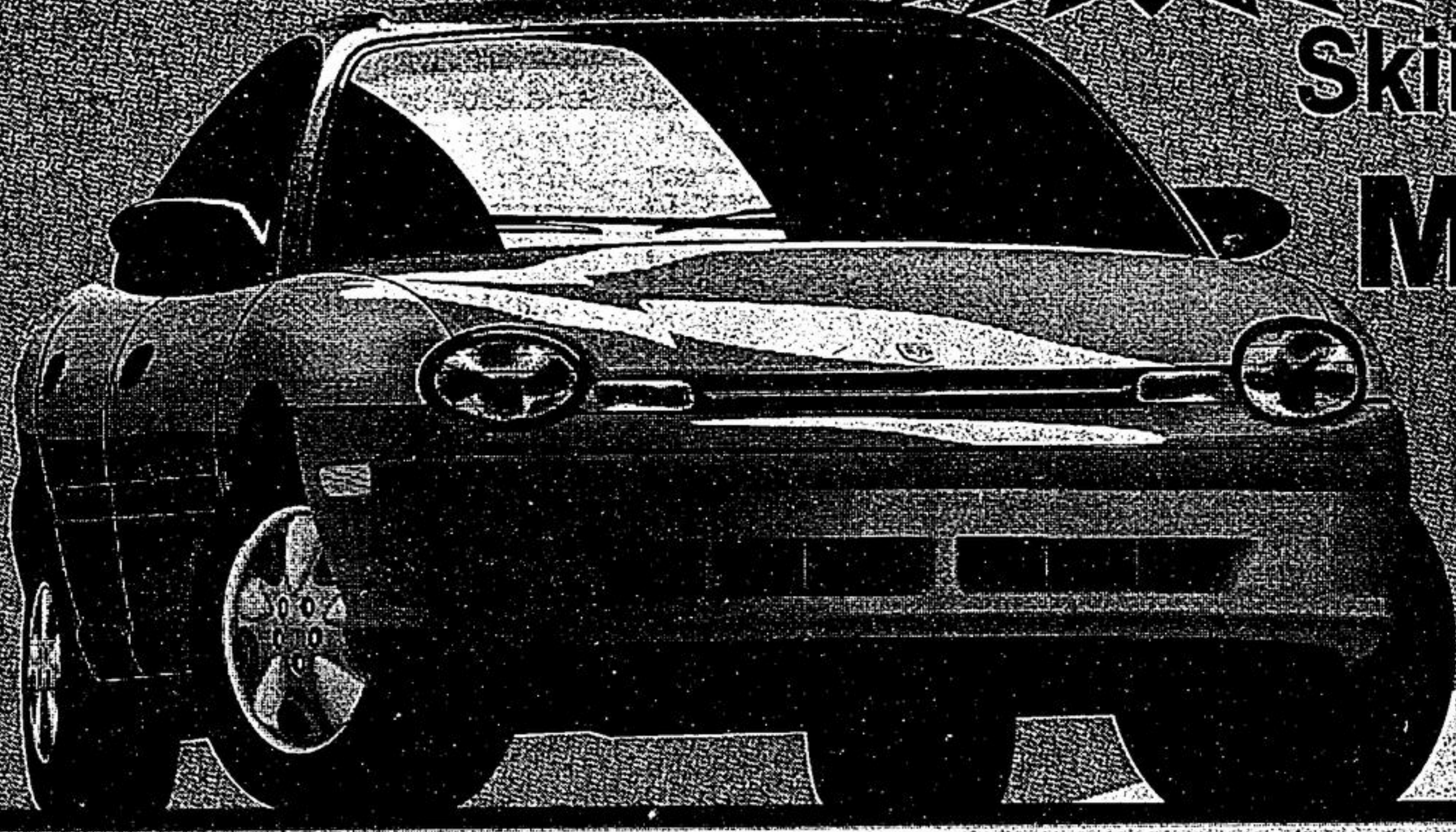
1996 DODGE NEON

You will be delighted with the performance of this great Neon. Featuring: automatic, air, fold down rear seats plus much more.