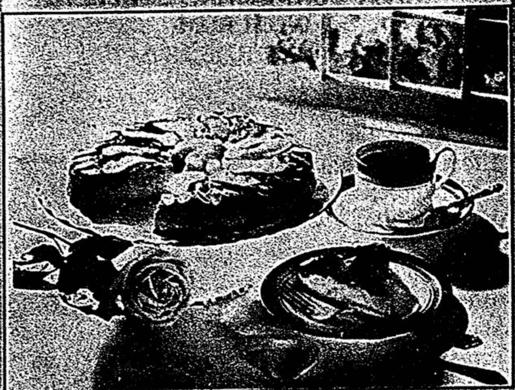
Apple almond cake is a perfect ending to a special holiday dinner or for serving when friends and family drop by.