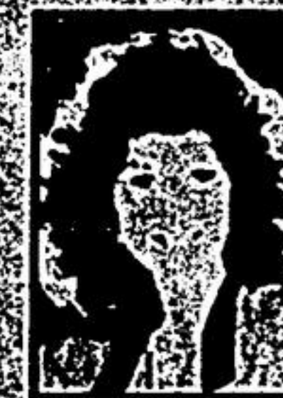
SUE AUGUSTINE International Speaker/Author She presents "The Power of the Female Voice" focusing on techniques to effectively manage and control the power of our female presence.