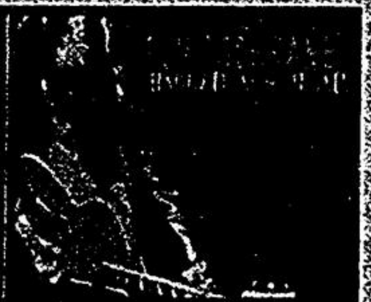
Tom Cochrane "Ragged Ass Road"