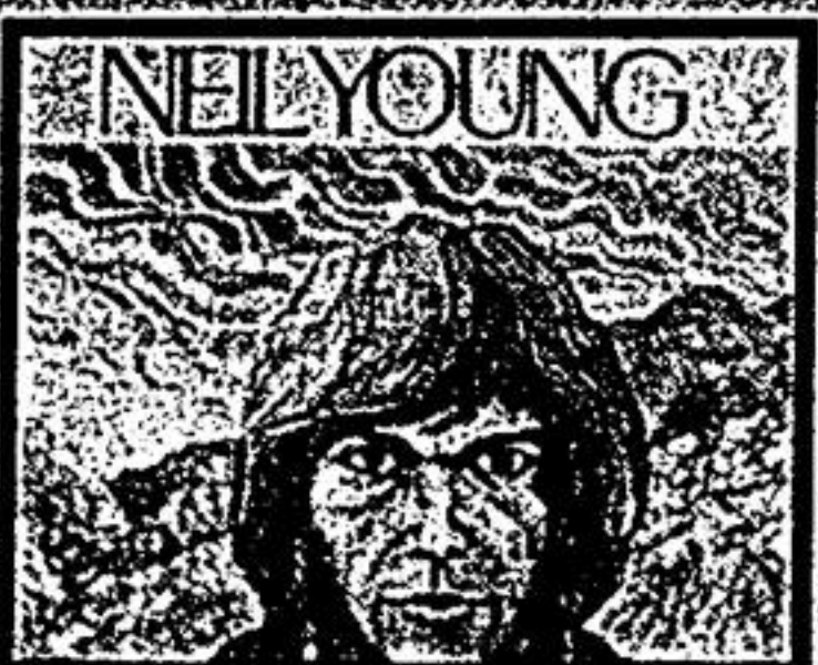
Neil Young "Neil Young"