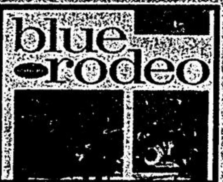
Blue Rodeo "Diamond Mine"