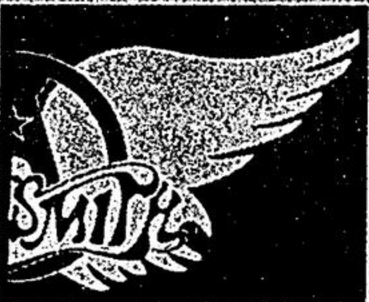
Aerosmith "Greatest Hits"