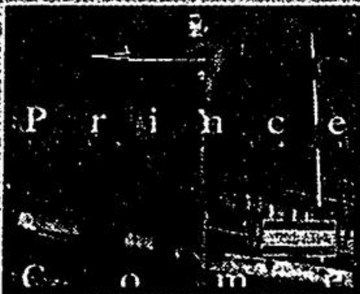
Prince "1958-1993 Come"