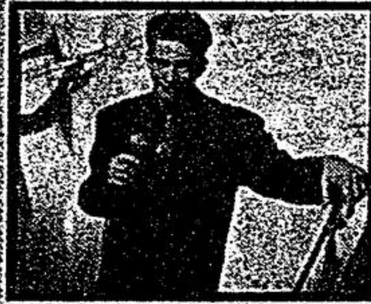
Harry Connick Jr. "We are in Love"