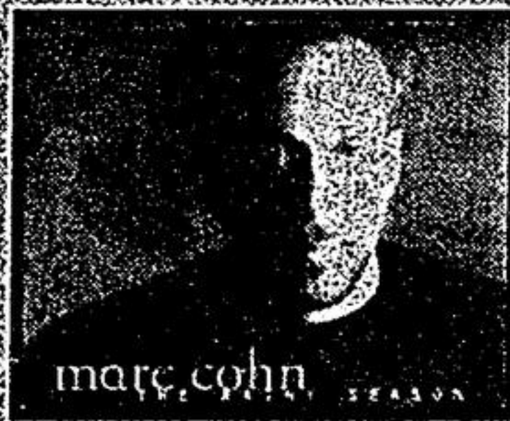
Marc Cohn "The Rainy Season"