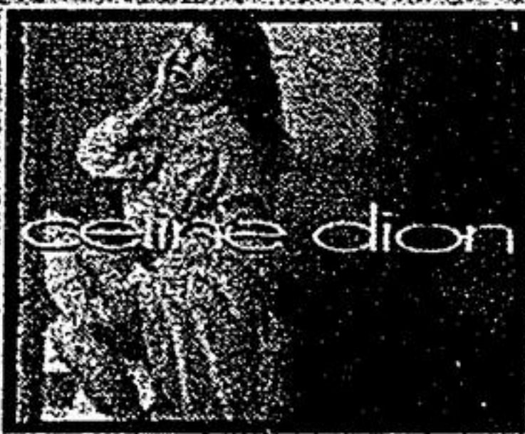
Celine Dion "Celine Dion"