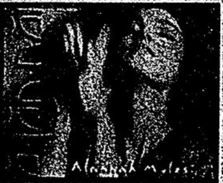
Alannah Myles "Alannah"