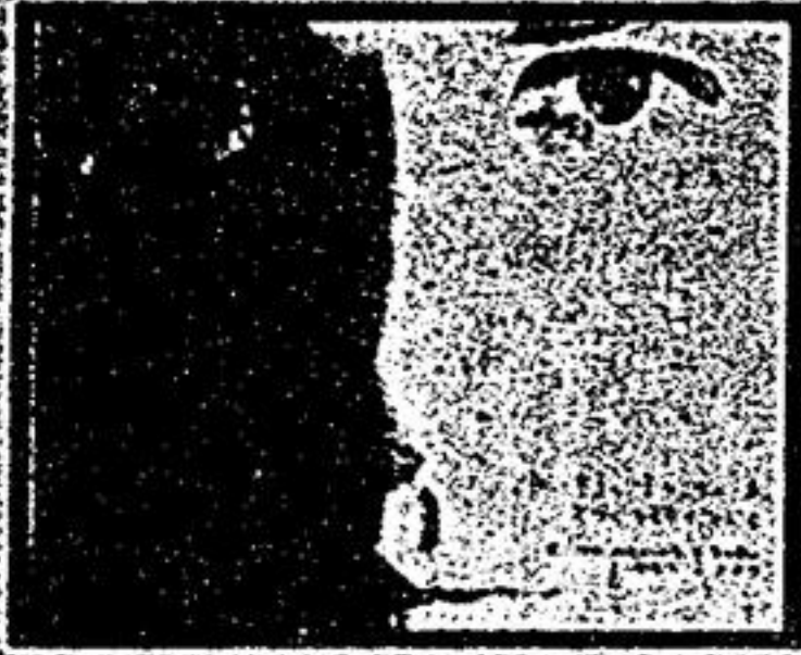
Michael Bolton "Greatest Hits 85-95"