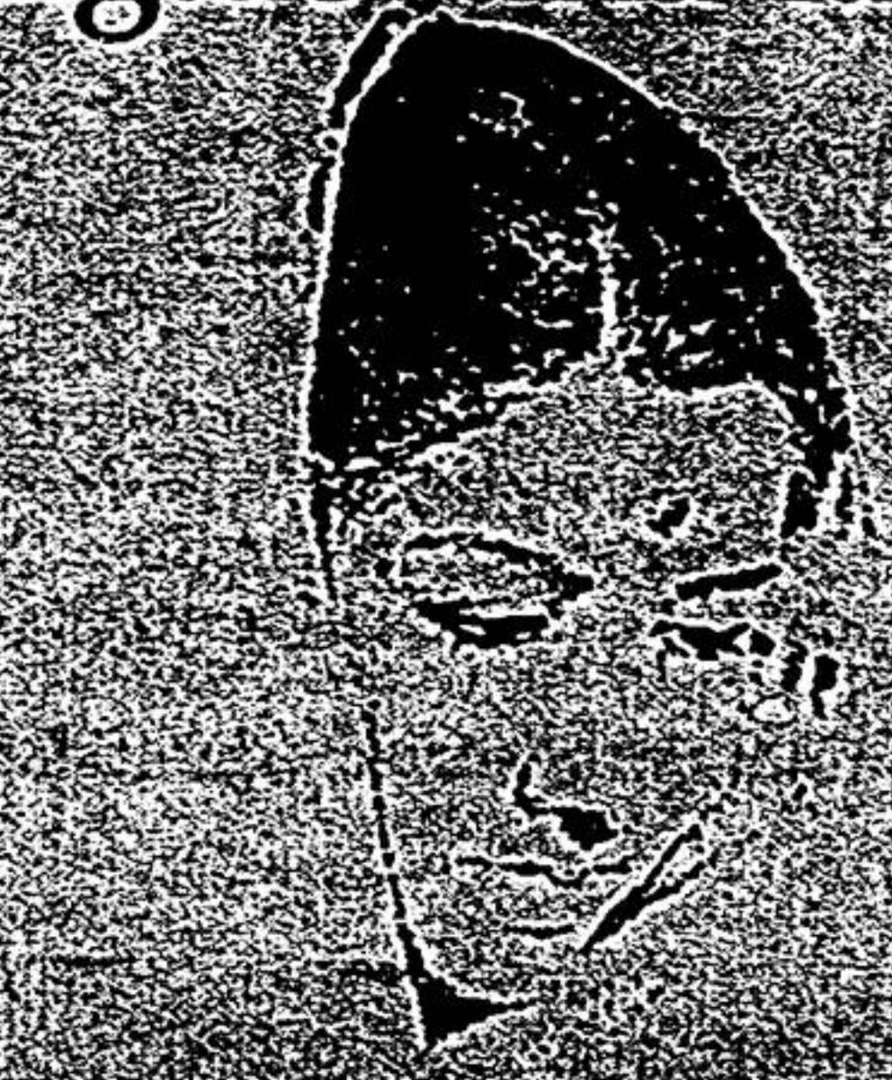
Lata Mangeshkar honored at tribute dinner and special convocation.

A September 20 tribute dinner and special convocation was held for Lata Mangeshkar and raised $100,000 towards a goal of $2 million for an Indian Studies Centre. Says Morzaria, "We'd like to have the centre ready to launch during the 50th anniversary of the independence of India in 1997."