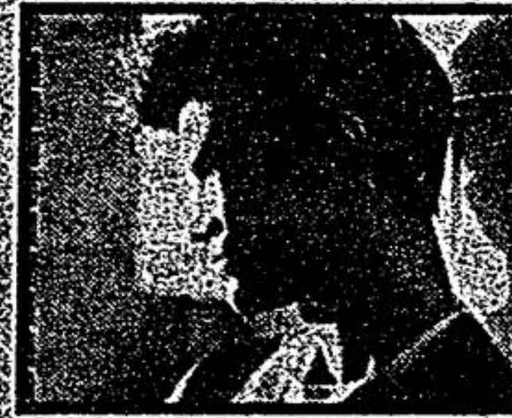
Chris Isaak "Chris Isaak"