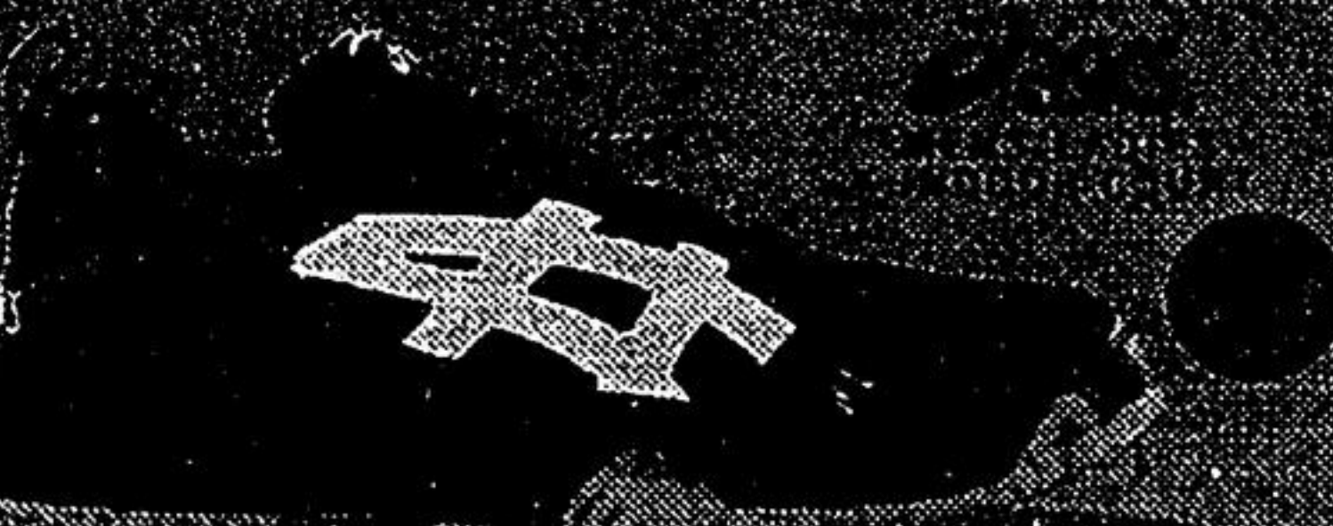
ASICS GEL BURNER LOW Reg. $114.00 Shoe Strings Price: $57.00