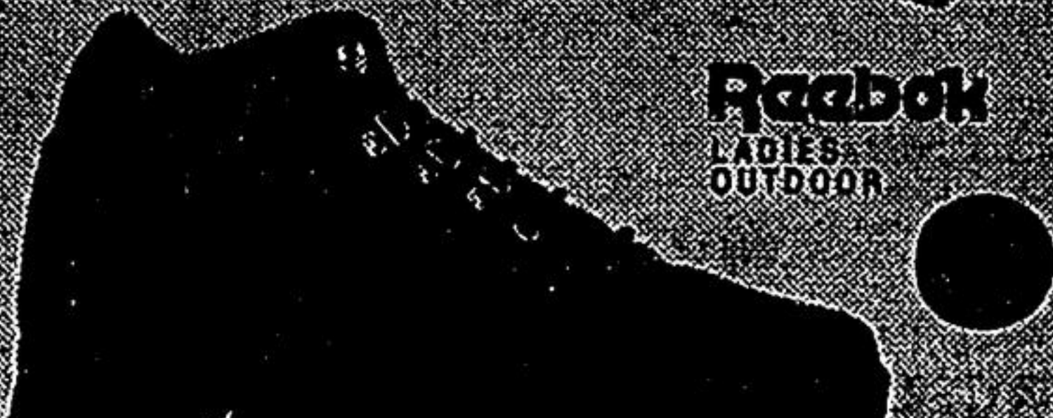
REEBOK VIRAZON Reg. $88.00 Shoe Strings Price: $44.00