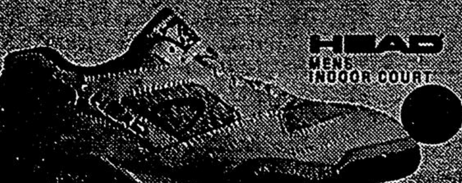
HEAD SONIC 135 Reg. $68.00 Shoe Strings Price: $34.00