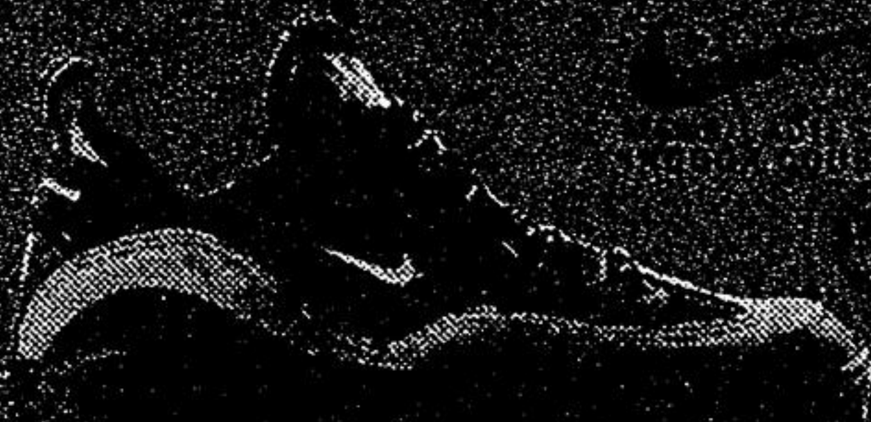
NIKE AIR MADA PLUS Reg. $124.00 Shoe Strings Price: $62.00