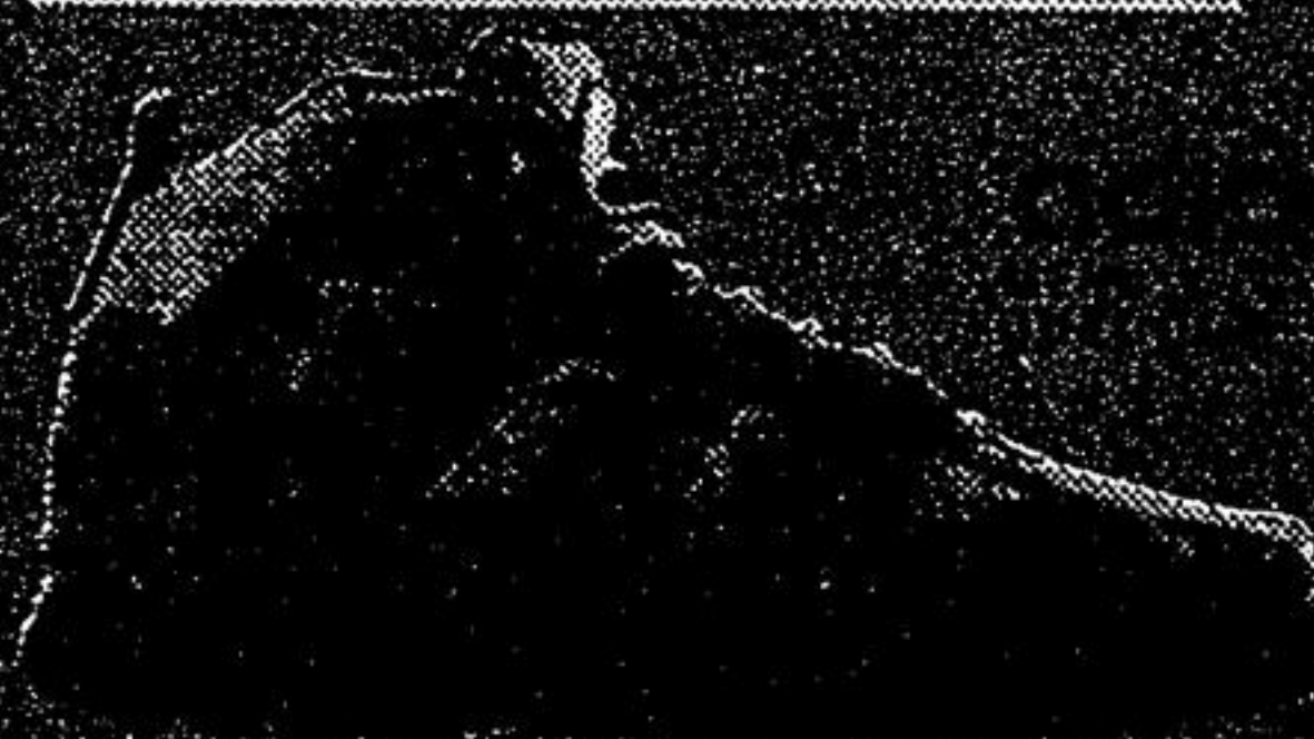
ADIDAS VULCANO Reg. $98.00 Shoe Strings Price: $49.00