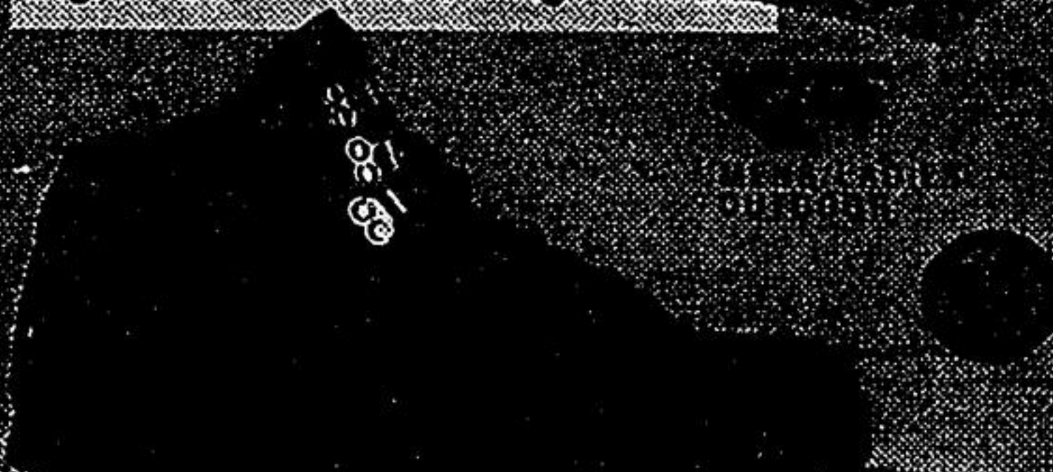
HI TEC SIERRA LITE Reg. $79.00 Shoe Strings Price: $39.50