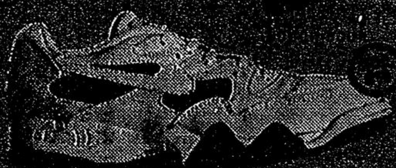
NIKE AIR DIGGS Reg. $98.00 Shoe Strings Price: $49.00

2ND AT 1/2 ALL CLEARANCE PRICED APPAREL!