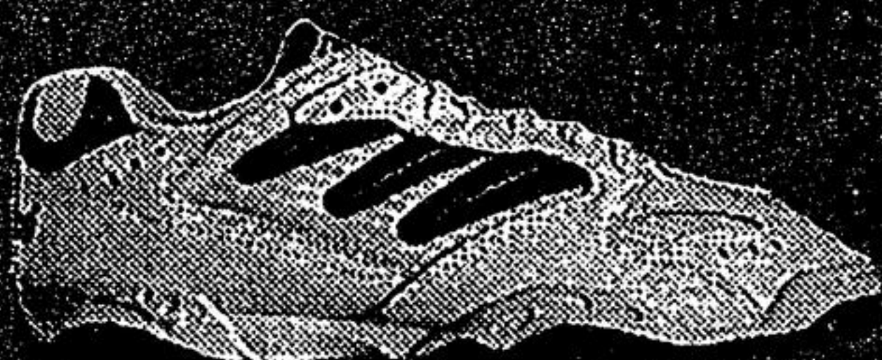
ADIDAS COMMITMENT Reg. $58.00 Shoe Strings Price: $29.00