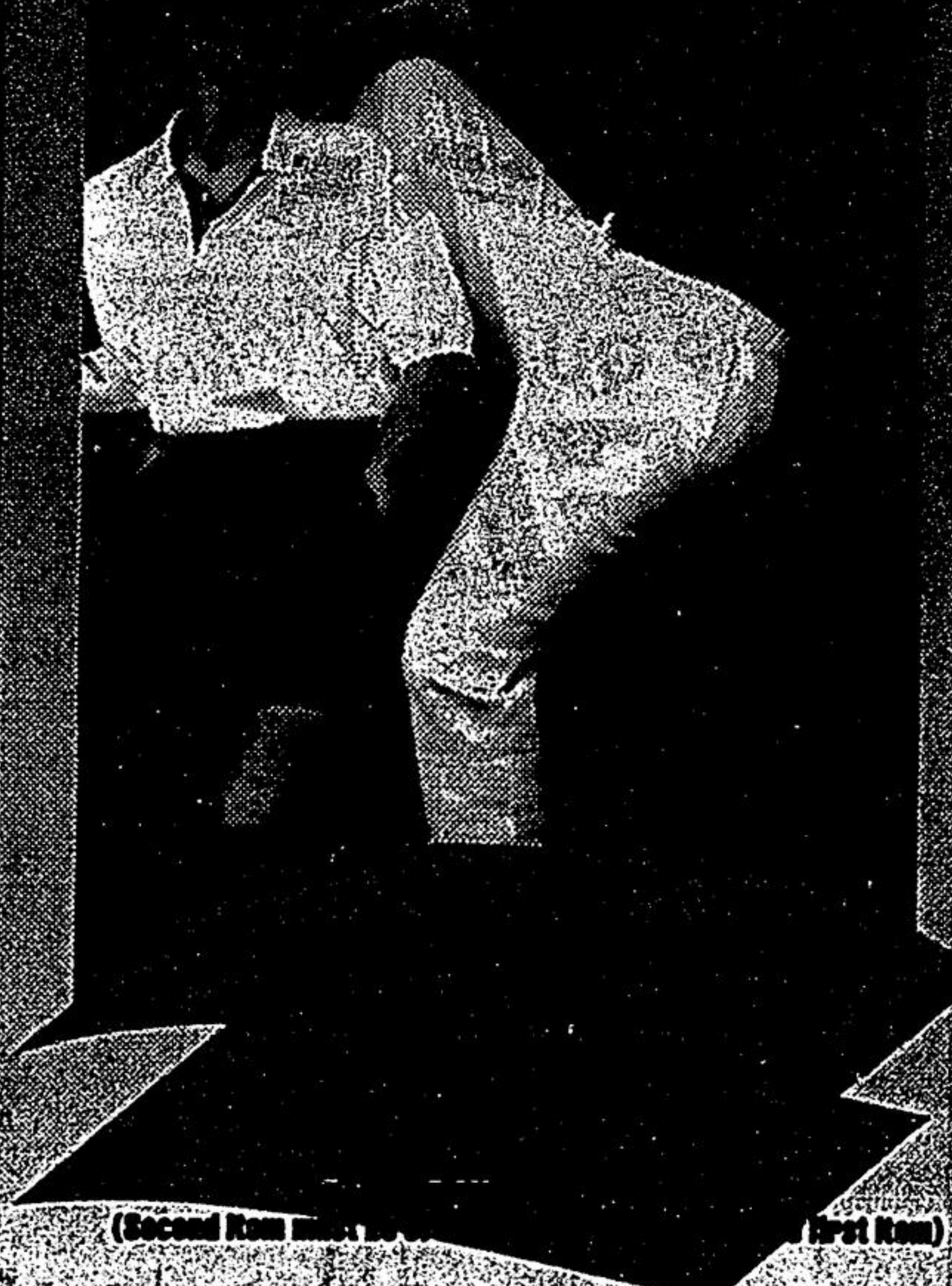
(Second item 1/2 off, first item full price)