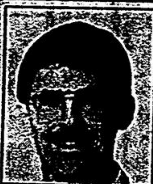
From where I live