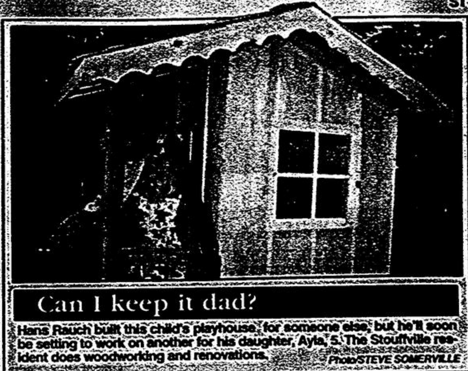
Can I keep it dad?