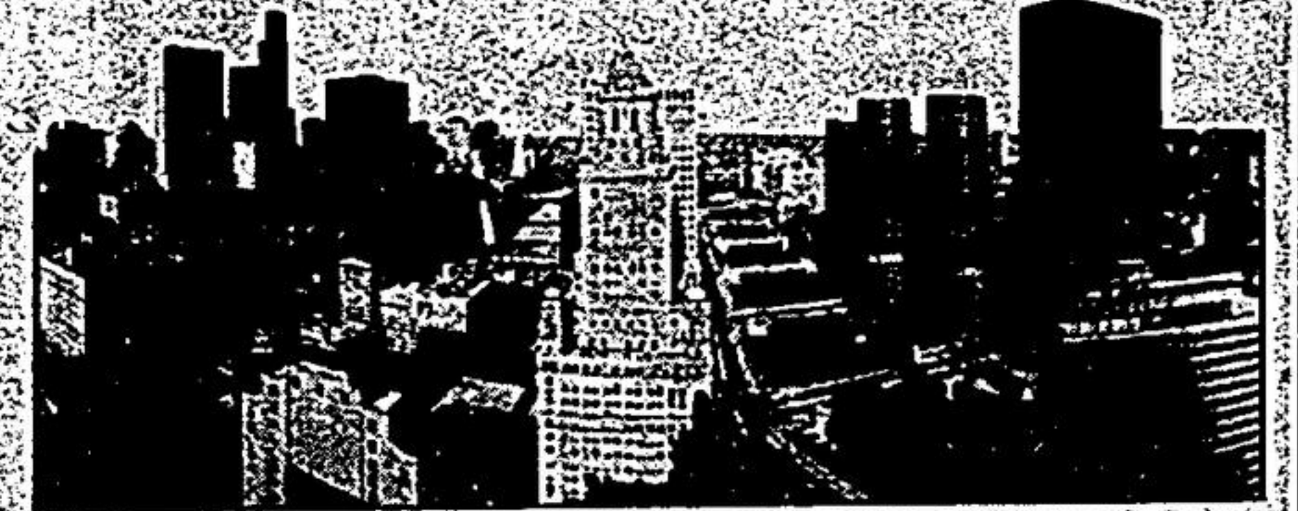
28 th ANNUAL PARADE OF BARBERSHOP HARMONY

MEMBER OF THE ONT. DIST. ASSOC. OF CHAPTERS